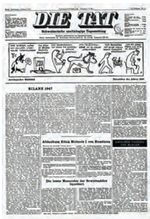
Die Tat, 1.1.1948

Sprachspiegel is available from 1945 to the present, though the most recent 24 months are blocked from online consultation. In all, 22 118 (or around 5.7 per thousand) of our 3 850 667 volumes of books, newspapers and periodicals were available online at the end of 2015. That corresponds to around 12.1 million pages (2015: 11.2 million).