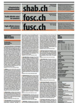
Swiss Official Gazette of Commerce, 1 (2014)