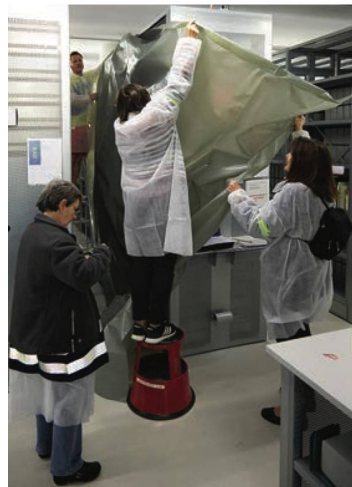
Disaster contingency plan exercise, 5.7.2017

To prepare for the migration, data quality in the applications affected was tested, and the data were cleansed where necessary. They are now all coded in accordance with the international standard MARC21 and correctly linked to the combined authority file GND. Both are requirements for the migration and also for interoperability of the NL's data.