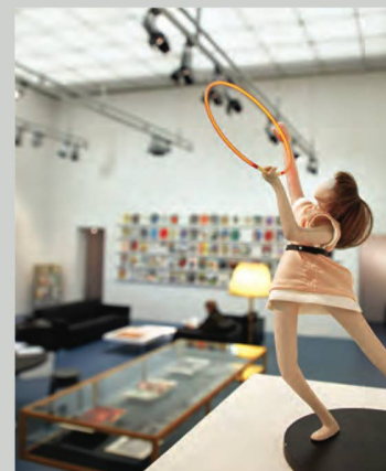
The exhibition also presented works created exclusively for the Parkett publishing house

This exhibition presented, for the first time, all 101 issues of the art magazine Parkett , a Swiss publication that gained a global reputation. It was also a chance for visitors to look back at the history of contemporary art from 1984 to 2017. In addition to every issue of the magazine, the exhibition showed a selection of works created exclusively for the Parkett publishing house by artists such as Andy Warhol, Bruce Nauman and Pipilotti Rist. These were complemented by information on the history of Parkett and the changes in the art press since the 1980s. Conceived in close collaboration with the publishers, the exhibition was accompanied by the digitisation of every issue of Parkett ; these are now freely available online at www.e-periodica.ch .