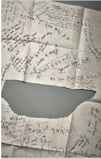
Literally an interface archive: Niklaus Meienberg, "Dialog auf einem Papier-Tischtuch", Restaurant Kropf, Zurich, 1992