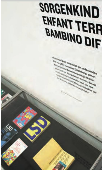
Accompanying the exhibition "LSD. Ein Sorgenkind wird 75", the book by chemist Albert Hofmann was presented in a number of editions and languages

Albert Hofmann's best-selling book LSD, mein Sorgenkind served as the starting point for this exhibition on the eventful history of LSD. In 1943 Hofmann, a Swiss chemist, discovered the drug's hallucinogenic effects after taking it himself. LSD has influenced literature, art, music and society like no other chemical product. In an irony of history, the first partial ban on LSD in Switzerland dates back to 1968, a year that is famous for very different reasons! The exhibition also looked at the current uses – both illegal and medical – of a substance that one day could still go from "enfant terrible" to child prodigy. A number of the objects on display, both from the NL's collections and on loan, were being shown to the public for the first time. The exhibition attracted a record number of visitors.