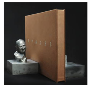
Urs Lüthi, Serre-livres (Bookends) , 2011