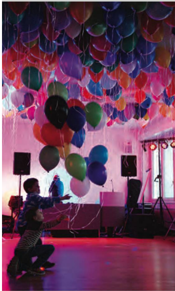
Children had the chance to release balloons on Museum Night