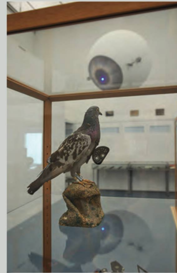
Image-recording technologies past and present