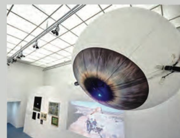
The drone kept the exhibition in view the whole time