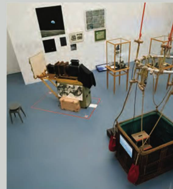
View of the exhibition gallery from above