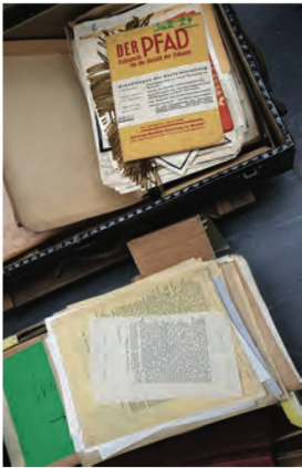
A glimpse inside the Storrer box