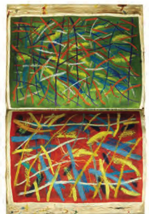
Christoph Hauri, Grosses Malbuch , unique artist's book, 2003