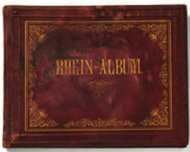
Album des Rheins , ca. 1860