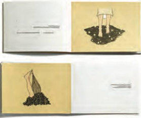
La vie a quelque chose du vide entre chaque battement d'ailes de papillon , 2019