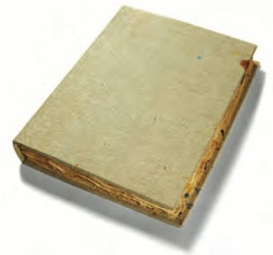
The unassuming cover of Christoph Hauri's Grosses Malbuch , unique artist's book, 2003

16 black and white photos of Swiss glaciers as vintage silver gelatin prints (2014–2016). Ed. no. 1 / 2 (2018/2019). Photographic series based on Daniel Dollfuss-Auset: Collection of 28 Daguerreotypes constituting the oldest heliographic reproductions of the Alps, reproduced as photographs and accompanied by extracts from the material for the 1893 Study of the Glaciers.