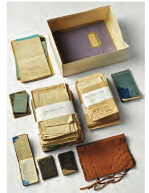
The literary estate of Chasper Po

ZYTGLOGGE: the fonds of the Zytglogge Verlag, a publisher established in Bern in 1965 that later also operated as a recording label. It includes around 1400 audio media (LPs, CDs, cassettes, DVDs and VHS cassettes) from the Zytglogge holdings of the Burgerbibliothek Bern.