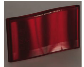
Dictabelts are embossed audio media of which the Archives hold numerous examples