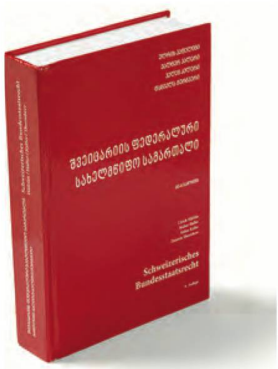
Schweizerisches Bundesstaatsrecht , Georgian translation, 2019