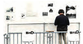
Photographing with drones