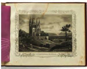
Illustration in the Album des Rheins , ca. 1860

Following its redesign in 2018, the NL's website ( www.nb.admin.ch ) continues to be updated regularly. In social media, the NL is active on Facebook , Twitter and Instagram . It also maintains a YouTube channel on which it posts videos on relevant topics and its exhibitions. In all, the NL's German-language Facebook page has almost 11 000 followers and the French-language page more than 9000. The NL's German Twitter feed has just under 2500 followers and the French-language version almost 1700. Since it was launched in 2018, the multilingual Instagram feed has accumulated just over 600 subscribers, and this figure continues to grow.