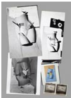
Daniel Spoerri: Photographs from the assemblage Gebauchpinselt from the series Pièges à mots ( Wortfallen ), c. 1966