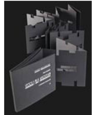
Serge Chamchinov: Leporello fold on the short story The Tunnel by Friedrich Dürrenmatt, 2021

At 775, the number of information and research requests was well below the levels of previous years. The collection areas most in demand were the Federal Archive for Monument Preservation (2021: 230, 2020: 231), photography (2021: 322, 2020: 319) and prints and drawings (2021: 223, 2020: 236). The number of visitors on site was slightly higher than the previous year, but still well below pre-pandemic levels. Fortunately, loans of originals from the Prints and Drawings Department were in high demand for external exhibitions in 2021: the previous years' figures were exceeded both in terms of the number of exhibitions served and the number of documents loaned.