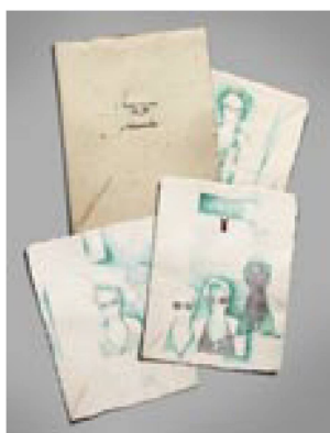
Fiorenza Bassetti: artist's book, comprising 10 watercolours and envelope, c. 1980