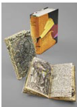
Bernhard Luginbühl: Two diaries (c. 1975 and 1992) and Das Knochenlied