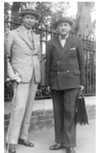
Piero Coppola with Sergej Prokofiev