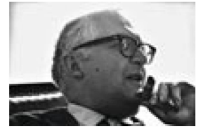
Friedrich Dürrenmatt

The Swiss National Sound Archives played host to the 2021 annual congress of the Germany/Switzerland branch of the International Association of Sound and Audiovisual Archives – IASA. The event was held online and was used by the Swiss National Sound Archives as an opportunity to present the institution and its activities to a specialist audience and to network. The two-day congress was attended by around a hundred participants.