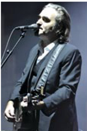
Stephan Eicher