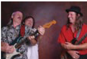
The Jimi Hendrix cover band More Experience

The digitisation of recordings of the Lugano municipal council meetings from the period 1962 to 2003 is a significant cooperation project. The Swiss National Sound Archives launched the project in 2021 with the Lugano administrative archives and the Memoriav association to safeguard and upgrade the audio recordings. The project involves the digitisation of over 400 magnetic tapes held in the administrative archives over a period of four years. The public can already listen to some of these recordings in the digital catalogue of the Swiss National Sound Archives, and therefore discover a valuable piece of historical heritage, which provides an important insight into the history and political life of the city of Lugano.