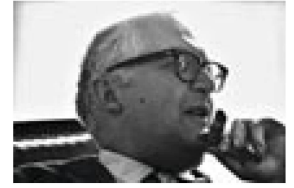
Friedrich Dürrenmatt

The Swiss National Sound Archives played host to the 2021 annual congress of the Germany/Switzerland branch of the International Association of Sound and Audiovisual Archives – IASA . The event was held online and was used by the Swiss National Sound Archives as an opportunity to present the institution and its activities to a specialist audience and to network. The two-day congress was attended by around a hundred participants.