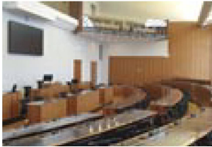
Lugano municipal council chamber

Once again in 2021, the Swiss National Sound Archives worked to preserve and mediate Switzerland's audio heritage in collaboration with various institutions. For example, together with the administrative archives of the city of Lugano and the Memoriav association, it launched a project to safeguard audio recordings of meetings of the Lugano municipal council between 1962 and 2003. It also acquired important collections, such as those of the Swiss band More Experience and Zurich's Widder Bar. In addition, to mark the centenary of Friedrich Dürrenmatt's birth, it released a phonography on the Swiss writer and painter.