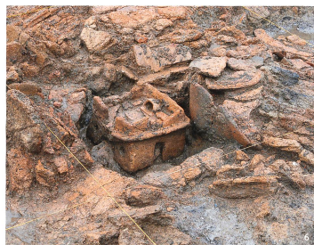
Fig. 6 Limnochori II (Late Neolithic I) Clay house model from the destruction layer representing a two-storey pile dwelling.

Das Modell eines Lehmhauses aus der Zerstörungsschicht zeigt ein zweistöckiges Pfahlbauhaus.