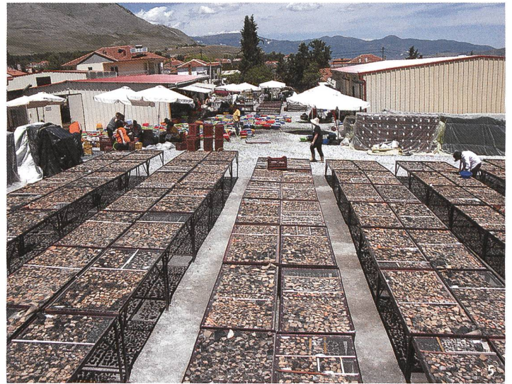
Fig. 5 Aghios Panteleimon. Drying and sorting of archaeological material. Trocknen und Sortieren von Funden. Séchage et tri du matériel archéologique. Asciugatura e classificazione dei materiali.

hundreds of graves organised in 18 tombs. This unique necropolis in the Balkans with its great variety of grave types, special burial customs and numerous high-quality grave goods was used for at least 500 years up to the first half of the 6 th century BC.