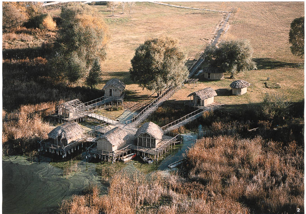
Foto aerea del Dispilio Pile Dwellings Eco-Museum.

Vue aérienne du Dispilio Pile Dwellings Eco-Museum.