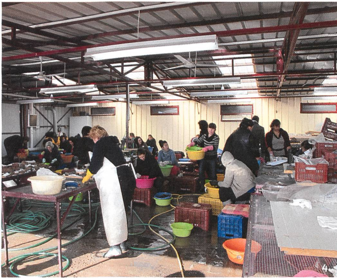
Fig. 4 Aghios Panteleimon. Cleaning of archaeological material. Fundreinigung. Lavage du matériel archéologique. Lavaggio dei reperti archeologici.