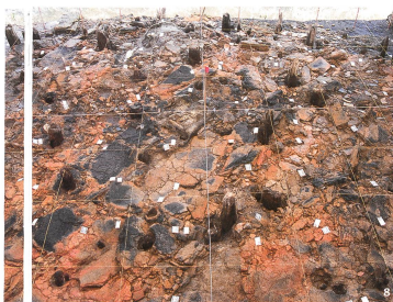
Fig. 8 Anarghiri III (Late Neolithic I) Destruction layer of the upper floor of a two-storey pile dwelling.

Neolithic periods (c. 4700-3300/3200 BC) the settlement was reduced to a dryland mound consisting of successive anthropogenic deposits. Two burnt layers and the wooden floor of a pile dwelling as well as numerous piles came to light in the lowest waterlogged layers of the lakeside settlement of Anarghiri III (c. 5300-4000 BC). The excellent preservation of the material allowed us to reconstruct two-storey buildings and their interior constructions and domestic artefacts on one hand, whilst facilitating the identification of spatial arrangements with regard to various household activities on the other. The upper storeys and attics of the dwellings were used as living quarters and areas of domestic activity, as attested to by hearths and ovens, grinding stones and large vessels for storing and preparing food, while the lower storeys with plastered floors were used to house the livestock. Right next to one of the ovens fragments of two female figurines came to light, which probably constituted the top parts of a clay house model. A plastered floor of a circular house was unearthed in the upper Final Neolithic dryland layers (c. 4500-3300/3200 BC), while the layers directly beneath the modern surface yielded a post-built house with two rooms. After the settlements mentioned had been abandoned two new lakeside settlements were built