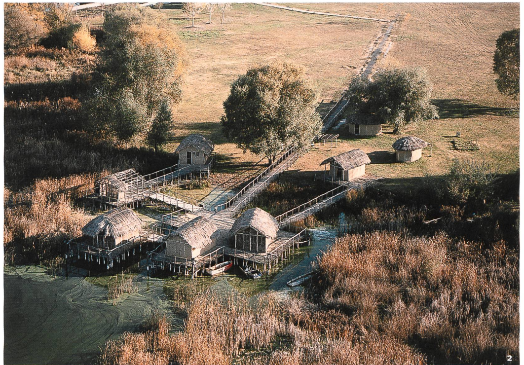
Foto aerea del Dispilio Pile Dwellings Eco-Museum.

Vue aérienne du Dispilio Pile Dwellings Eco-Museum.