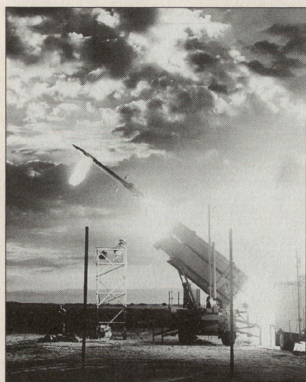
MEADS incorporates the proven hit-to-kill PAC-3 missile, now in production.

the state-of-the-art technology for countering tactical ballistic missiles and is armed with a lethality-enhancing warhead for use against air-breathing targets. The missile combines standard aerodynamic control surfaces and multiple single-shot thrusters to achieve the very agile high-g maneuvers required for precise hit-to-kill. In the terminal phase of flight, the missile acquires and tracks the target with its forward-looking gimbaled active RF seeker and is extremely difficult to jam, even with advanced cooperative mode jamming.