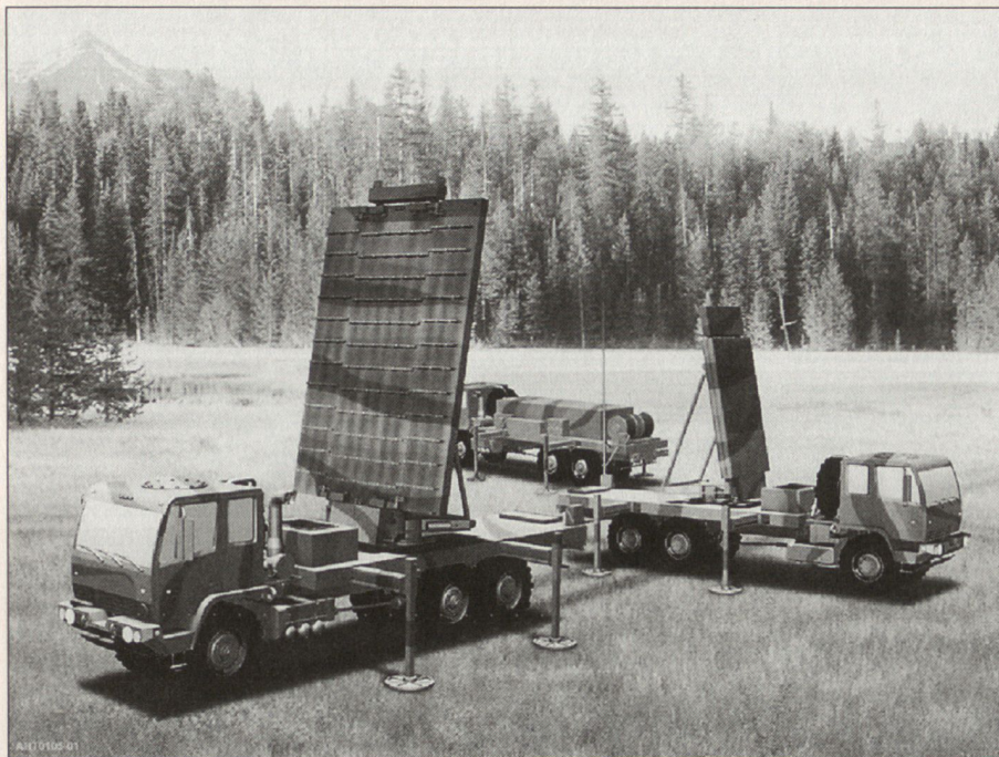
A standard MEADS fire unit incorporates two X-band MFCRs and one UHF Surveillance Radar.

The networked and distributed architecture being adopted for MEADS is fundamentally different from that of its predecessors. A "plug and fight" capability allows individual elements to be inserted as missions and threat dictate. MEADS major end items, Tactical Operations Centers (TOCs), radars, and/or launchers can be added or deleted to optimize the defense with minimal equipment and force structure. MEADS' plug-and-fight capability and comprehensive interoperability requirement will provide MEADS with the capability to command and control all the allied air defenses supporting an operation or theater.