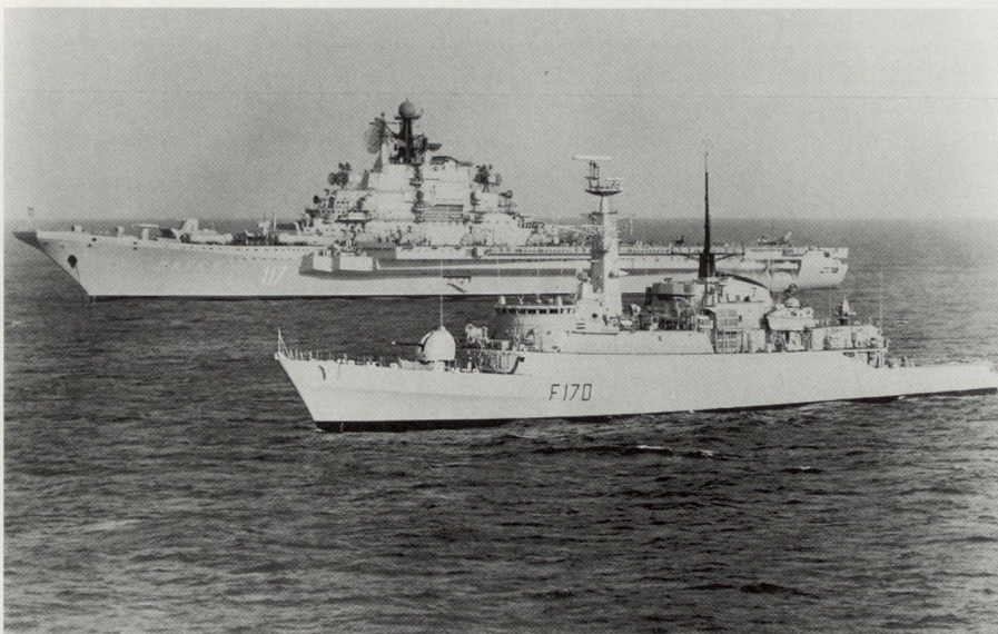
The Royal Navy always kept a number of ships deployed to the Mediterranean thus providing an important contribution to the security of the Southern flank of NATO. Here HMS Antelope , a type 21 frigate, keeps an eye on the Soviet helicopter carrier Minsk off Libya in 1979.

Equally, the British still face significant challenges if the armed forces are to play the role assigned to them by British security policy. The professional British Army