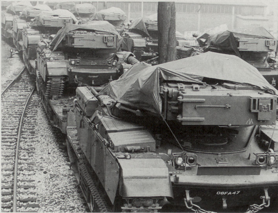
During the Cold War the United Kingdom had a strong permanent military force deployed to Germany. One British Army corps was responsible for an entire sector along the inner German border in the Hannover area. Here Chieftain combat tanks aboard flatbed cars are sent to the exercise area of "Spearpoint" in 1984 in Northern Germany.