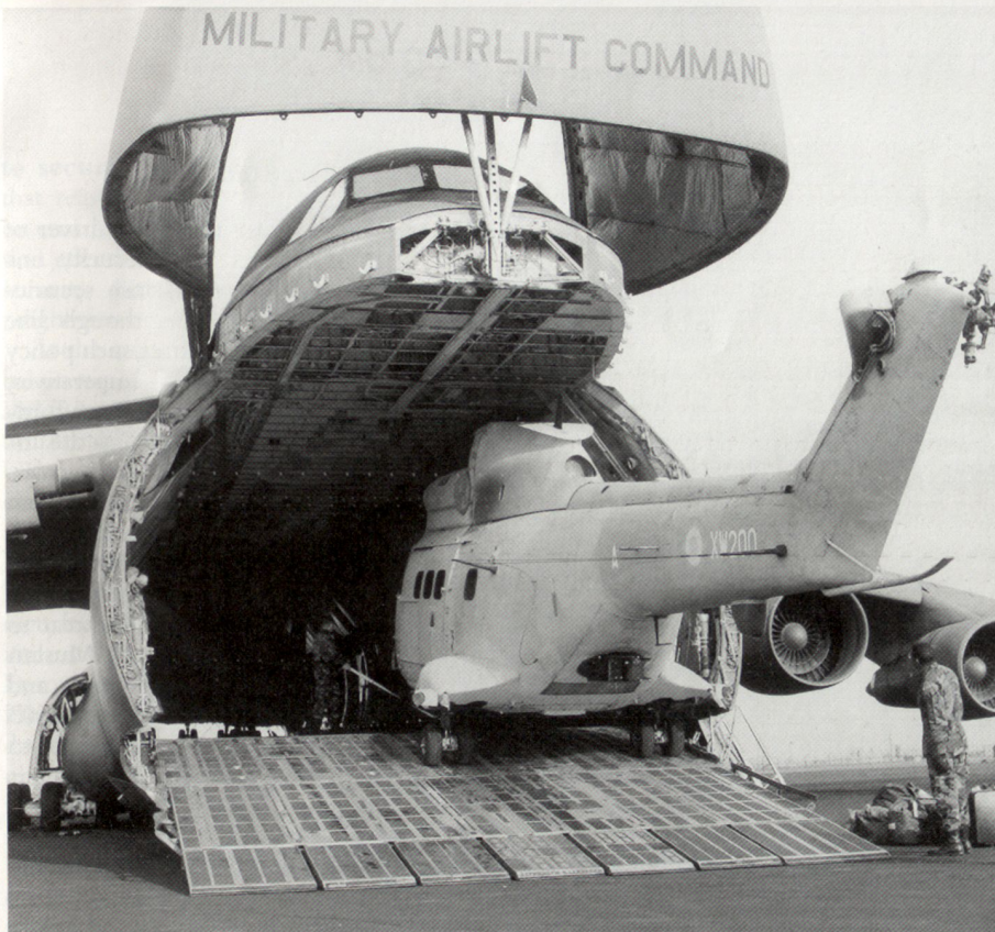
The United Kingdom always had and still has a very special and close relationship with the United States and its Armed Forces. During the first Gulf War in 1991 both countries were building a strong alliance against Saddam Hussein. Here a US Military Airlift Command C-5 Galaxy is loading British Puma transport helicopters at RAF Brize Norton to fly them to the Persian Gulf.

a cornerstone of British foreign policy. In an age of interdependence, it is more necessary than ever. But the scale and the complexity of today's challenges are putting pressure on a system designed in a different age. We must continue to lead efforts to reform these institutions to ensure they remain effective and respected'. 1