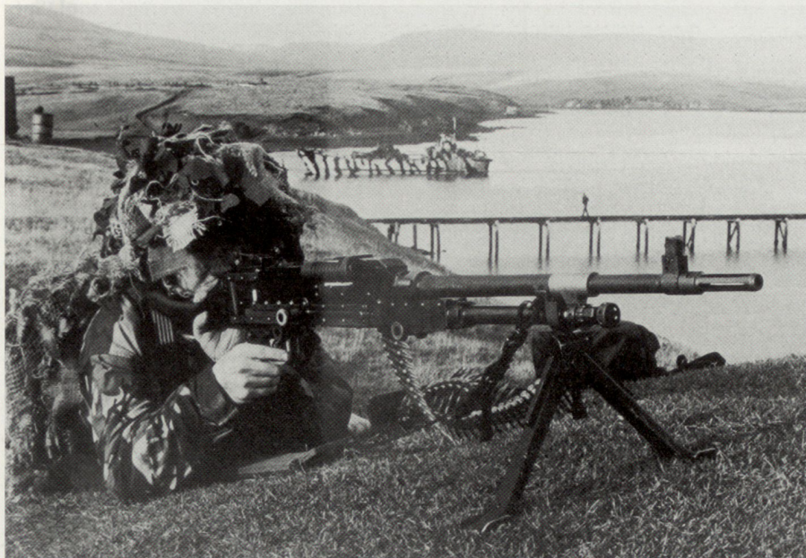
British forces have remained committed to many parts of the world, despite the closure of many bases abroad, particularly in the Far and Middle East. In 1982 Prime Minister Thatcher sent a strong military force to the South Atlantic to retake the Falklands Islands which previously had been attacked by Argentine forces. A paratrooper of the UK Land forces secures a bridge head on the Falklands.

Consequently, Britain seeks a more cohesive, state-led Common Foreign and Security Policy focused on the European Council that can rehabili-