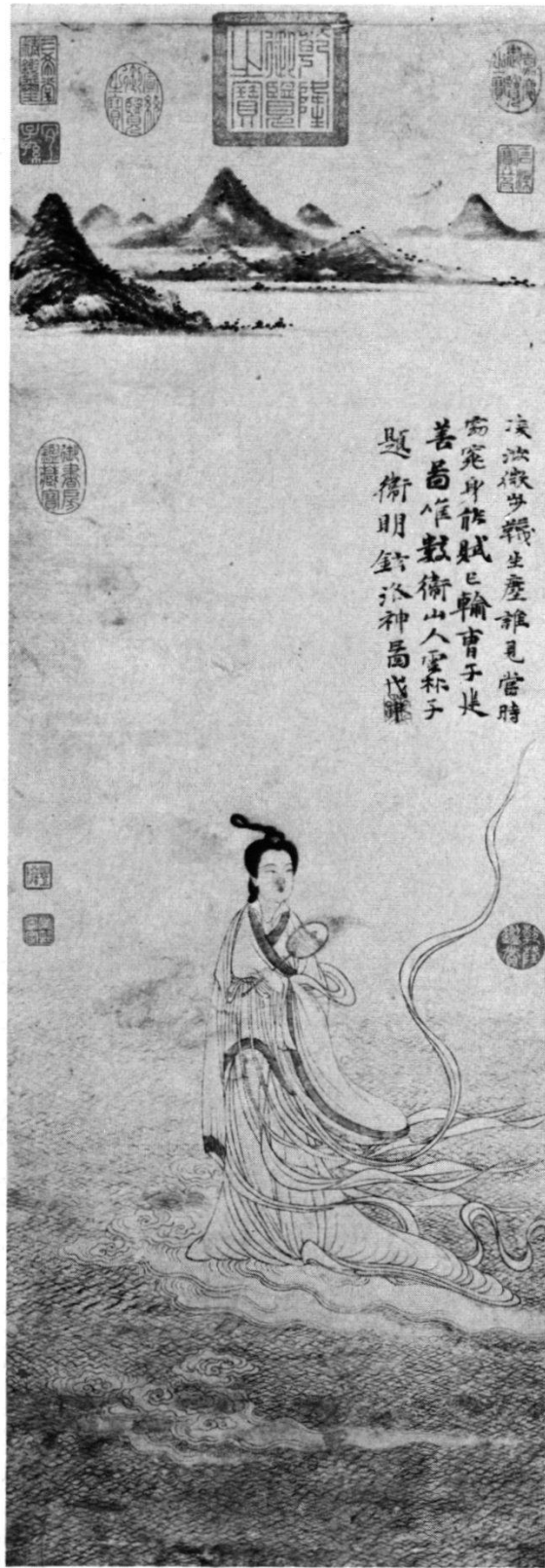
Fig. 14. Wei Chiu-ting (14th century), The Nymph of the River Lo Walking on the Waves , Palace Museum, Taipei.