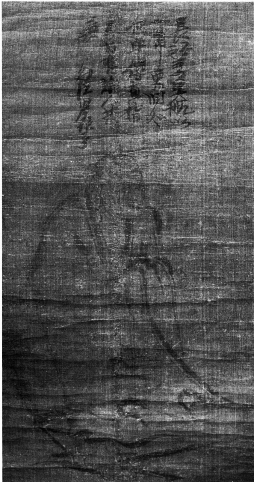
Fig. 3. Bodhidharma on a Reed , with an inscription by Chung-feng Ming-pen (1263–1323), Masagi Art Museum, Izumi-ōtsu, ōsaka Prefecture.