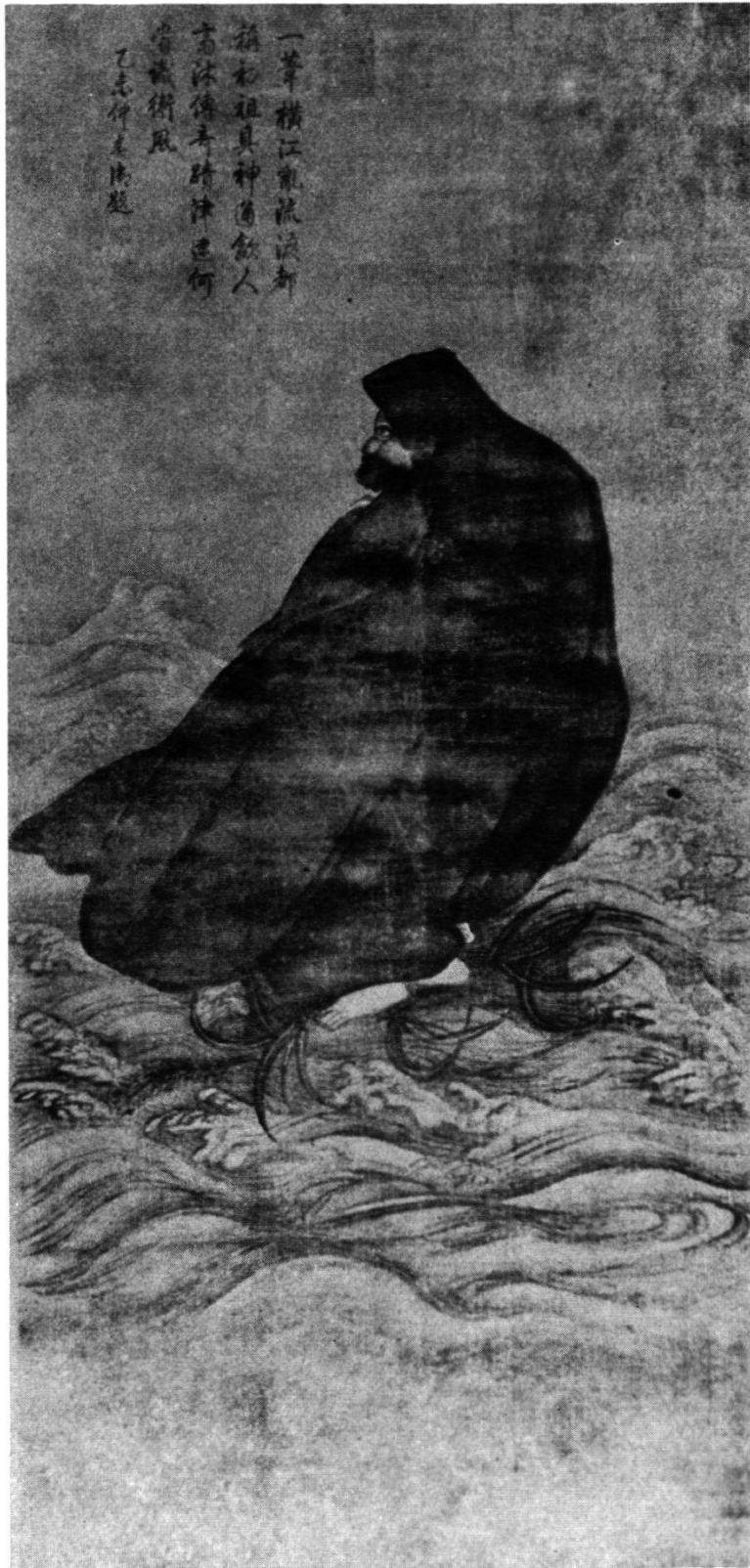
Fig. 11. Cheng Chung (early 17th century), Bodhidharma on a Reed . (From Chung-kuo ming hua chi , vol. II.)