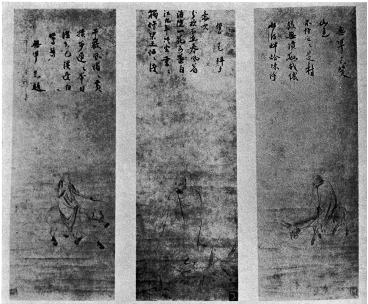
Fig. 2. Bodhidharma on a Reed , with an inscription by Wu-chün Shin-fan (1178–1249), Tokugawa Art Museum, Nagoya.