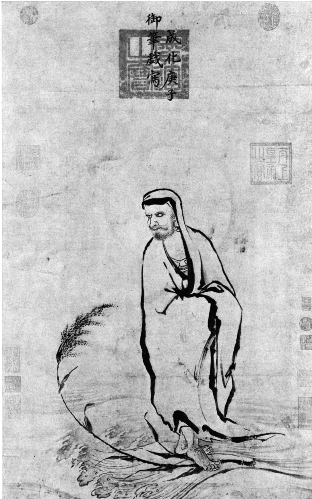
Fig. 6. Emperor Ch'eng-hua, Bodhidharma on a Reed , dated 1480, Palace Museum, Taipei.