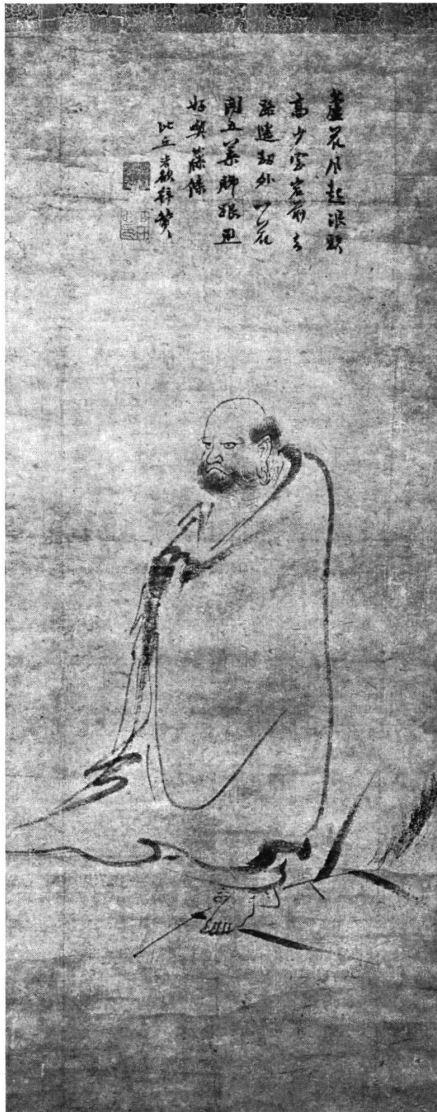
Fig. 5. Bodhidharma on a Reed , with an inscription by Liao-an Ch'ing-yü (1288–1363), Cleveland Museum of Art.