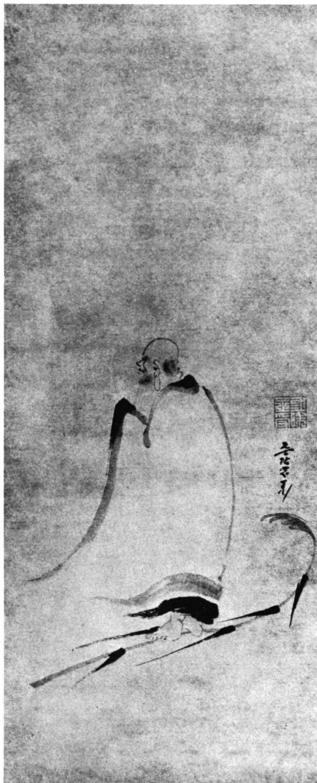
Fig. 4. Yin-to-lo, Bodhidharma on a Reed , Yüan Dynasty, Asano Collection, Tokyo. (From Asano Kōshaku Kahō E-tu , pl. 16.)