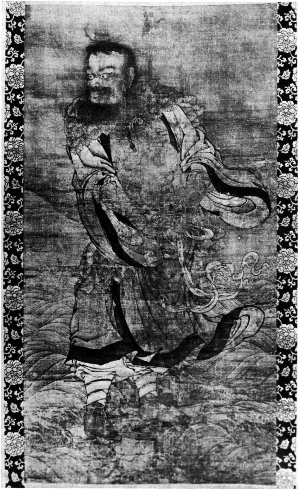
Fig. 15. Yen Hui, attributed to (14th century), Taoist Immortal Chung Li-ch'üan , formerly Tanaka Collection, Japan.