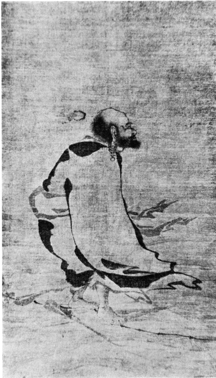
Fig. 7. Fumon Mukan, Bodhidharma on a Reed , Kamakura Period, Taman Collection, Osaka. (From Catalogue of the Oriental Art Exhibition from the Taman Collection , Osaka Municipal Museum, 1969, no. 37.)