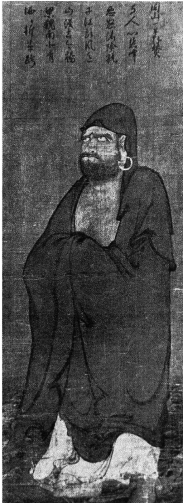
Fig. 9. Bodhidharma on a Reed , with an inscription by Kojan Itsukyō (ca. 1284–1360), Gyokuzoin, Kyoto. (From T. Matsushita, Suiboku-ga , pl. 30.)