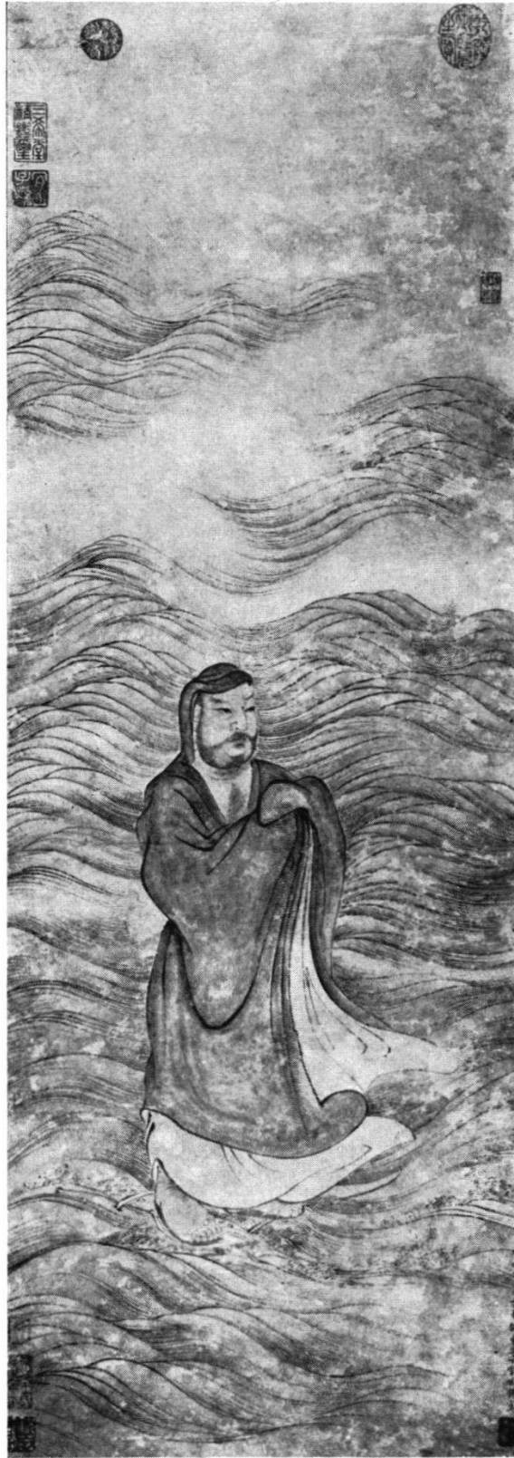
Fig. 1. Ting Yün-p'eng, Bodhidharma Crossing the Yangtze River on a Reed , dated 1574, Charles A. Drenowatz collection, Zurich.