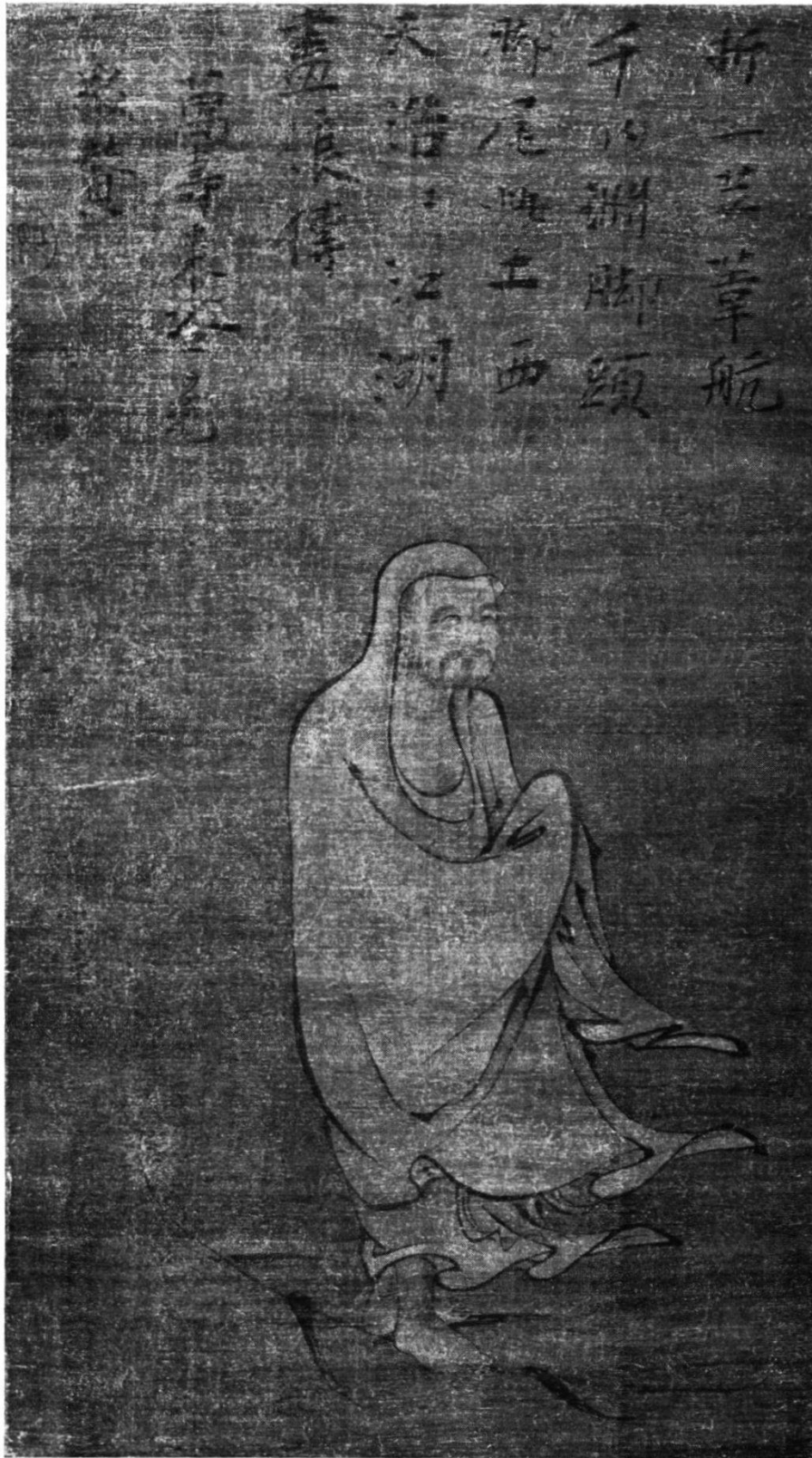
Fig. 8. Bodhidharma on a Reed , with an inscription by Tōkoku Myōyō, Kamakura Period, Freer Gallery of Art, Washington, D. C.