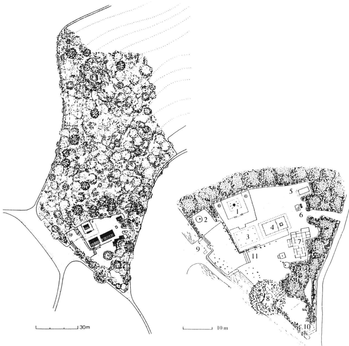
Figure 2 (left): Plan of the Matsushita Shrine with its grove extending up a hill behind the cult place (cf. figure 1).

( haiden ), subsidiary shrines and other structures, such as a haiden (hall for offerings) and a shamusho or shrine office.