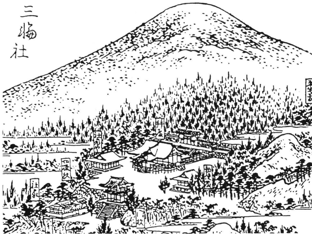
Figure 4: The Oomiwa Shrine as illustrated in the late 18th century Yamato Meisho Zue (section). Note that the buildings are oriented to a forest, not to the top of the mountain.

their offerings, while the way of approach for the ordinary visitors ends before the prayer hall that partly eclipses the fence from sight. The precinct in front of the cult place consists mainly of a long and narrow stand of trees to both sides of the way of approach. Given these facts, how can one explain that the cult at this shrine passes for a case of mountain worship?