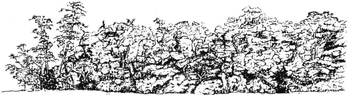
Figure 1: Grove of the Matsushita Shrine in Futami-chō, Ise City, Mie Prefecture. A shrine forest with a rich and rare vegetation. (Drawing based on photograph: Mioko Domenig-Doi).

If we approach shrine groves with the hope of finding luxuriant vegetation inside, we will usually be disappointed. Most of them are orderly forests that are rather common in their appearance. Even groves that have been found to be reserves of rare vegetation are often not very impressive when seen from inside. From the outside they may look dense and wild, but on entering we rarely find the kind of undergrowth one might think to be typical of a forest that has not been disturbed by human hands for a long time. Also groves of the more common kind are often quite impressive when seen from outside. When recognized as shrine forests, they can still be imagined to be the dwelling places of some deity, provided we forget about the reality that will face us when walking inside. The deities are said to be present through their material symbols, and these are normally kept in a shrine made by carpenters, not in the shadow of the trees.