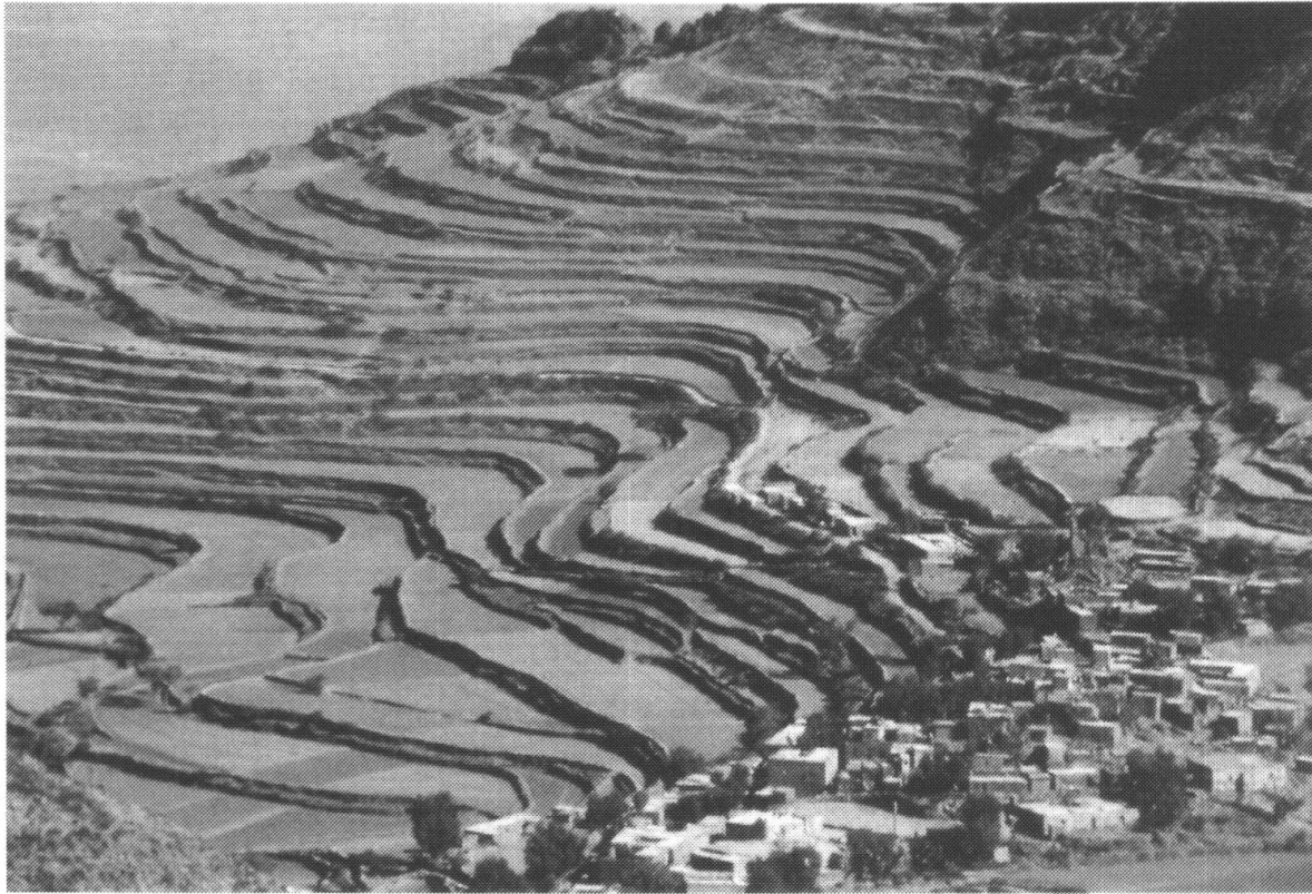
Figure 7: Terraced fields on the slope of Jabal al-‘Awd