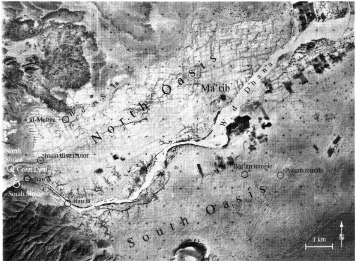
Figure 2: Aerial photograph of the oasis of Ma'rib showing the two ancient gardens (Royal Airforce 1971)