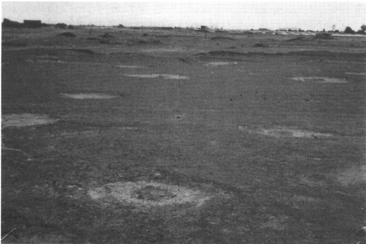
Figure 4: Mud rings on the surface of the ancient oasis of Ma'rib representing palm gardens of the Sabean time

Based on this knowledge about the function of the irrigation system, the cultivation on the fields, the extension of the agricultural zone and the sedimentation, a history of the irrigation in the oasis of Ma'rib could be drawn. In the North Oasis more than 30 m continuous irrigation sediments demonstrate a sayl -irrigation of at least 3'000 years. Since its end is fixed by