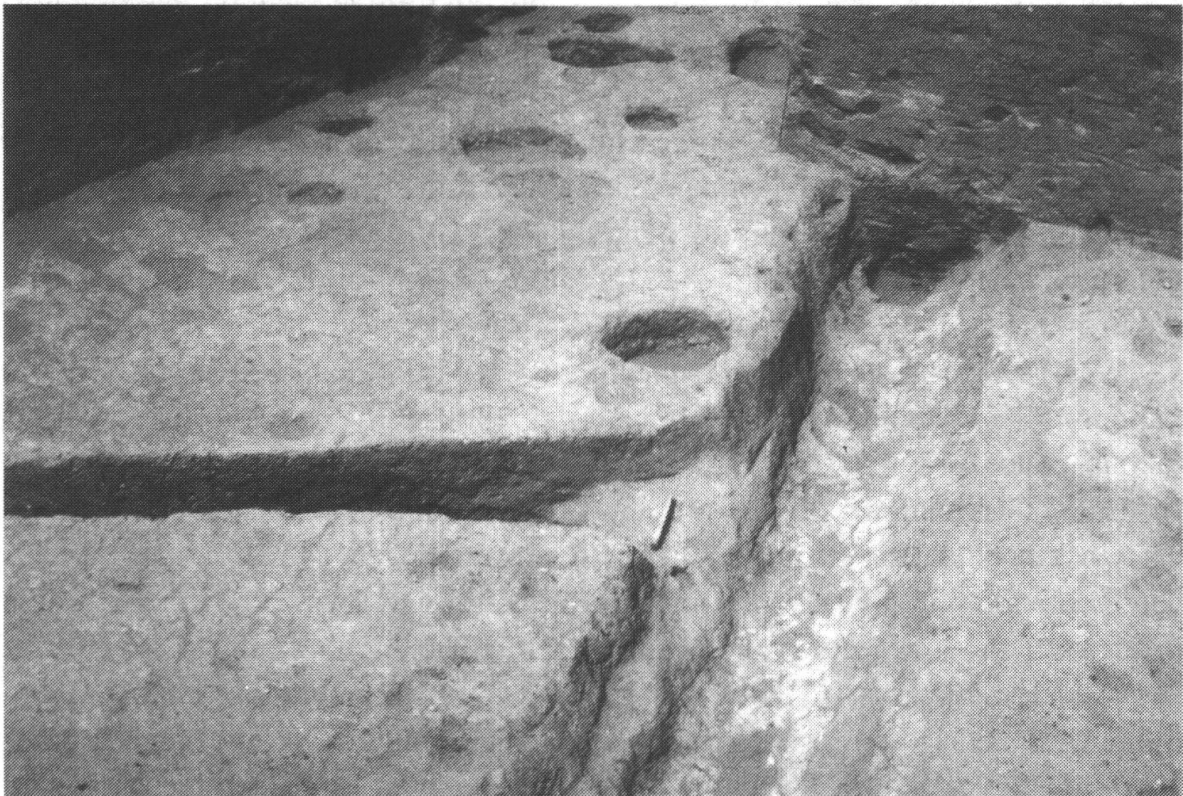
Figure 6: Early Bronze age canals in Ma'layba, oasis of Lahj

Summing up the results of the investigations in the oasis of Lahj, it can be stated that for the first time ancient irrigation could be ascertained in the coastal region of Southern Arabia. The beginning dates back to the early Bronze Age and—as a contrast to the wadis bordering the Ramlat as-Sab'atayn—food production of the Sabir culture based on two different ways of irrigation agriculture: sayl - and ghayl -irrigation.