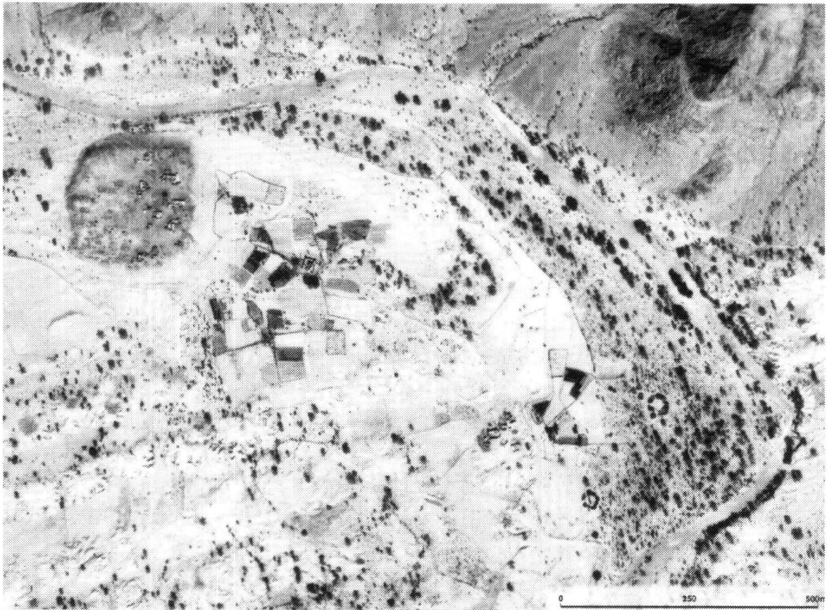
Figure 5: Aerial photograph of Hajar am-Lajîya in the Wadi Markha (Maps geosystems 1994)

It was obvious that trade played an essential role in its economy; it was even suggested that with Sabir the well known land of Punt may have been found. 28