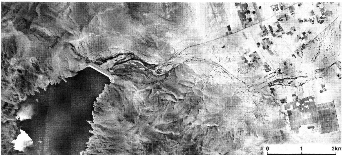
Figure 8: Changes of the landscape in the western part of the Ma'rib oasis between 1973 and 1989