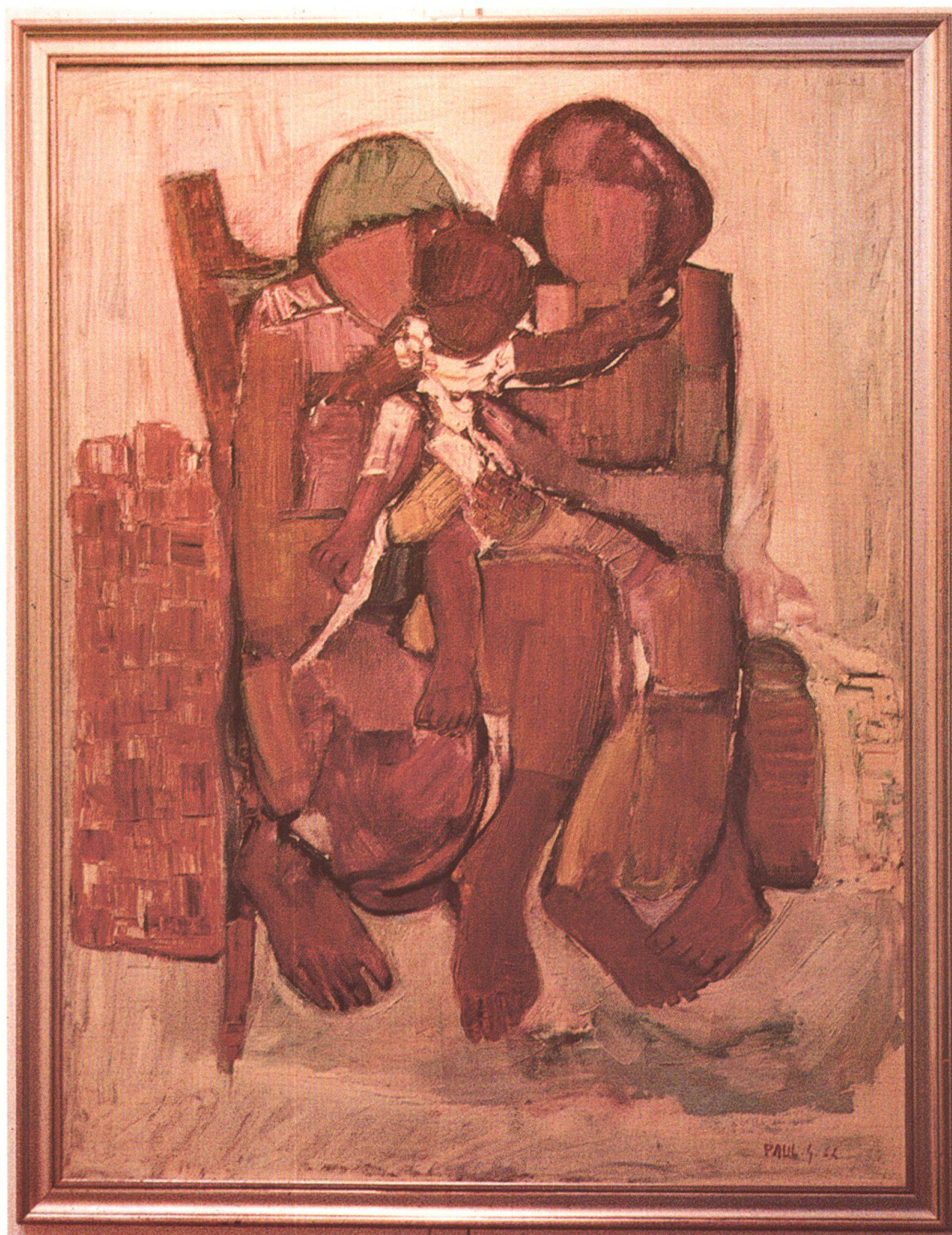
Fig. 4: Paul Guiragossian (Lebanese, 1926–1993), The Family , 1962.