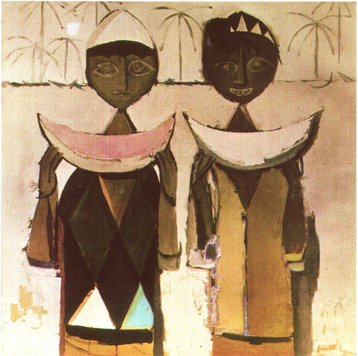
Fig. 2: Jawād Salīm (Iraqi, 1919–1961), Water melon eating children , 1950ies.