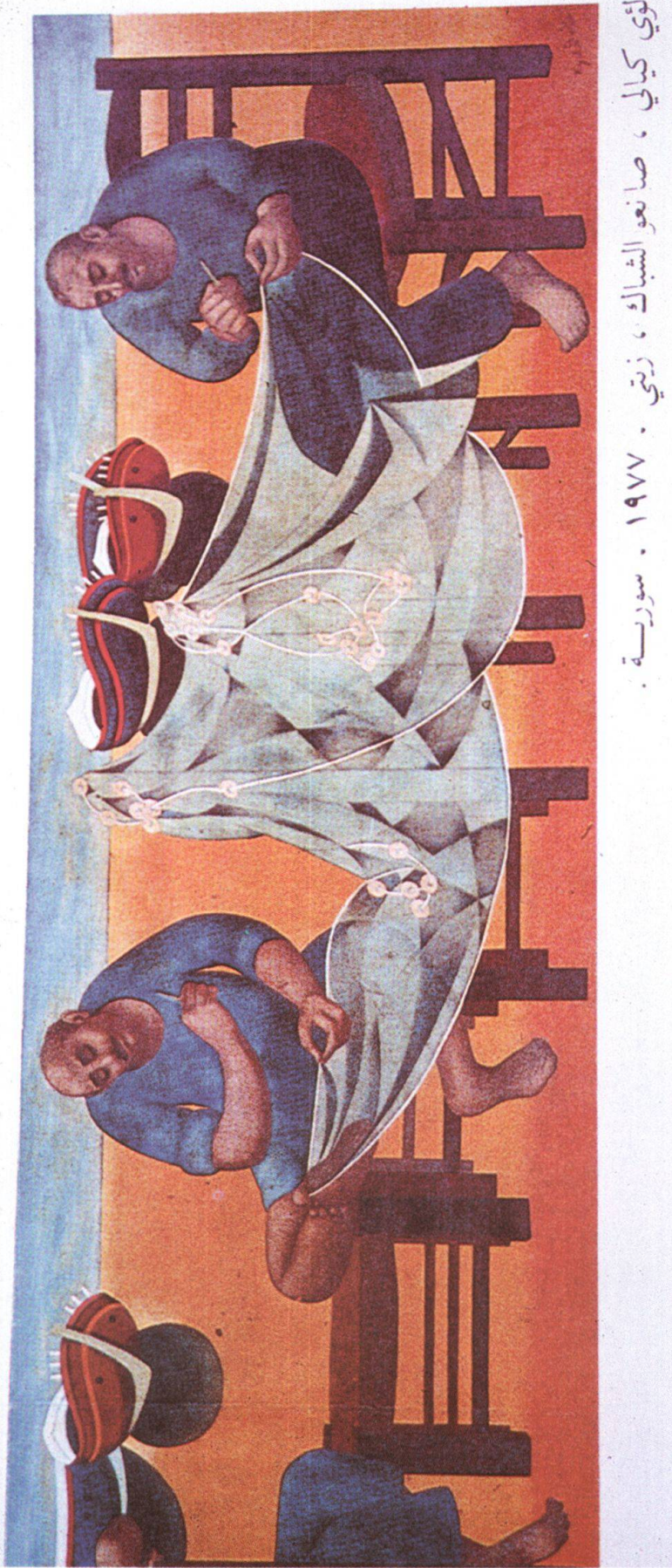
Fig. 8: Lu'ayy Kayyālī (Syrian, 1934–1978), Fishermen , 1977.