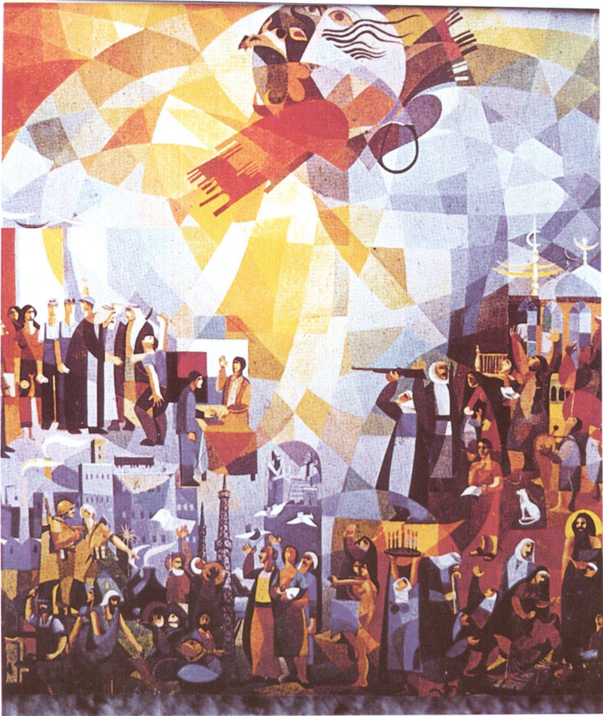
Fig. 6: Nizār al-Hindawī (Iraqi, 1947– ), Nationalization , 1974.