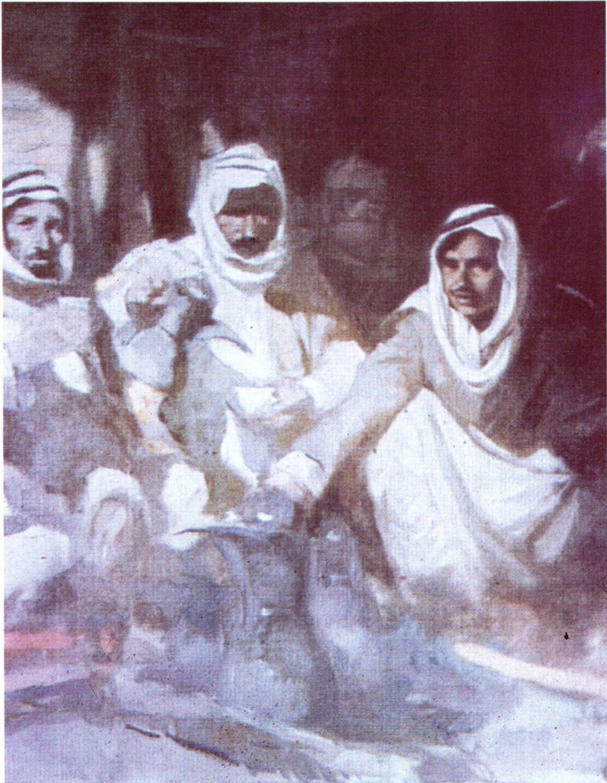
Fig. 7: Fāïq Hasan (Iraqi, 1914–1992), The Maḍyaf , 1975.