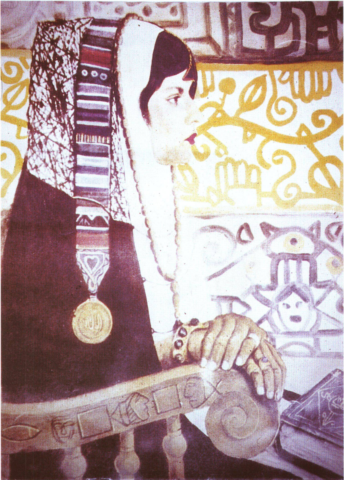
Fig. 3: 'Abd al-Hādī al-Jazzār (Egyptian, 1925–1966), Contemplation (Portrait of the artist's wife), 1960.