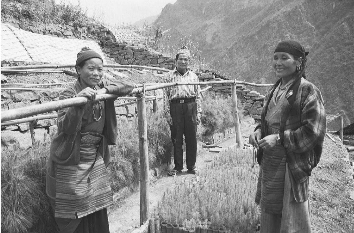
Photo 3: Women's group members and the caretaker in their tree nursery in Sekathum (photo by Martina LOCHER).

women. However, other villages with the same ethnic affiliation have women's groups that function well. This stresses the importance of support by the project staff in the process of forming women's groups.