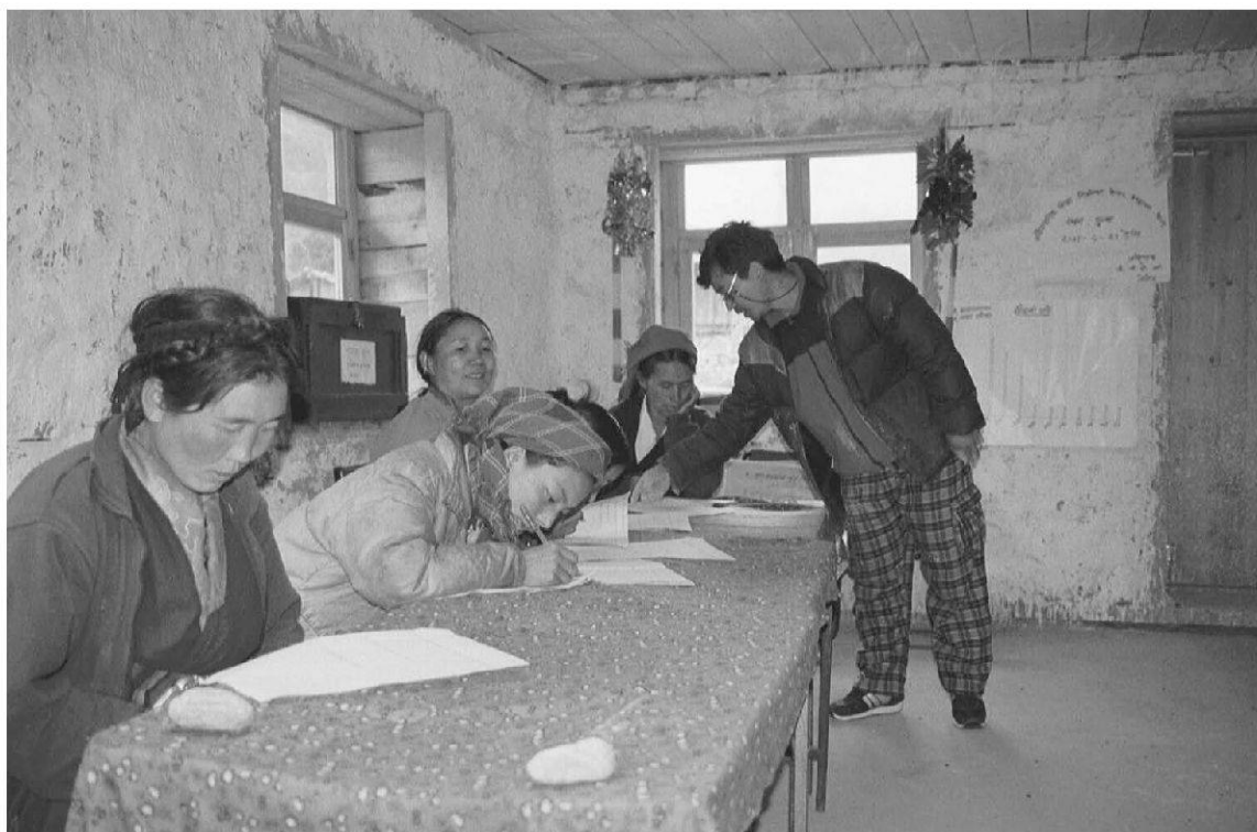
Photo 4: Advanced non-formal literacy class in Ghunsa.

including pictures were provided to introduce such key issues. In two villages, advanced classes were conducted, where the learning material was prepared by the participants themselves with the help of the teacher, using tools from Participatory Rural Appraisal (PRA).