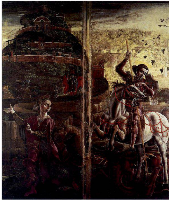
Plate E: Cosmé Tura, Saint George and the Princess (detail), 1469. Tempera on canvas, 349×305 cm. Ferrara, Museo del Duomo.