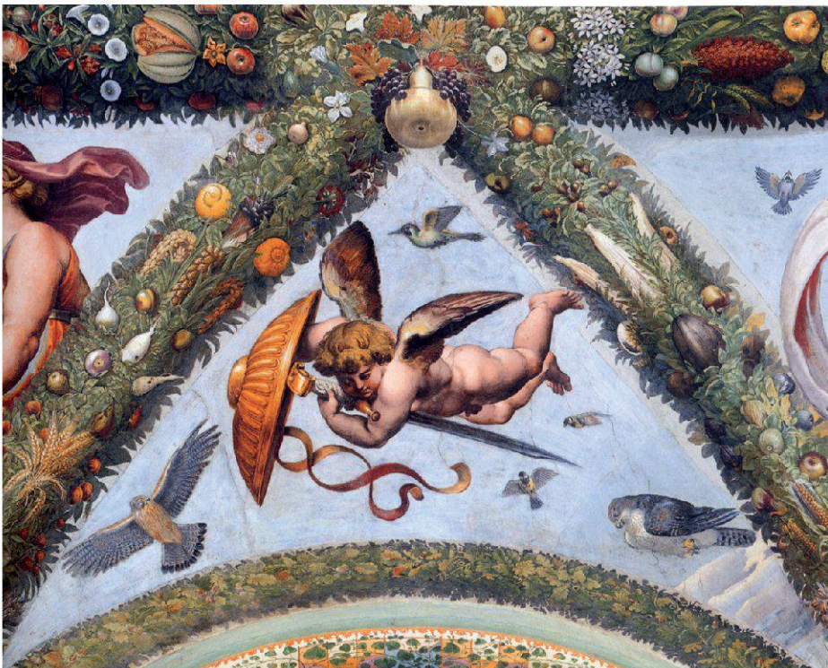
Plate F: Raphael (1483–1520) and Giovanni da Udine (1487–1561). Amor with the attributes of Mars , in the Loggia of Cupid and Psyche (Vault, 1518). Rome, Villa Farnesina.