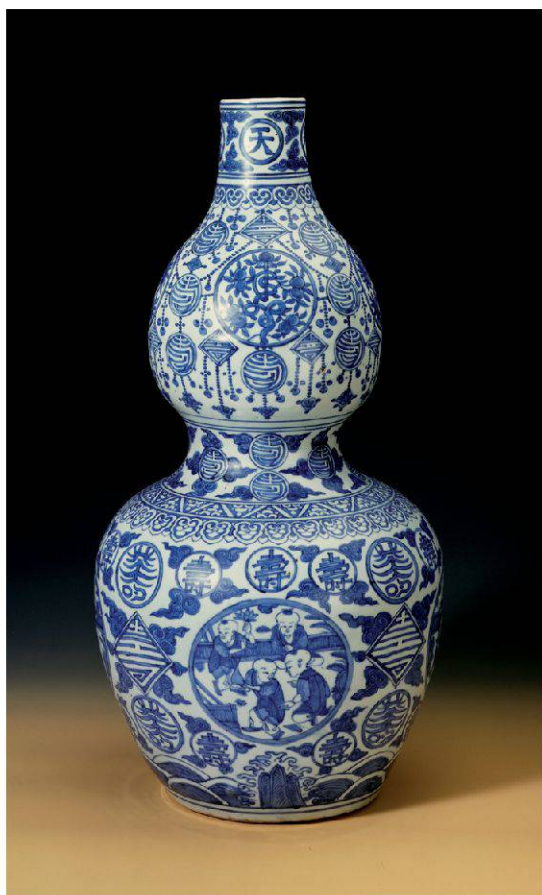
Plate C: A blue and white double-gourd vase decorated with shou 壽 characters and playing children. Jiajing period (1522–1566), height 62.2 cm.