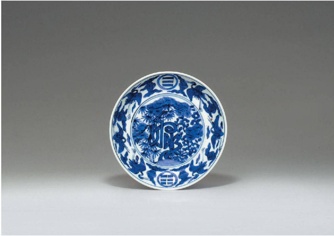
Plate A: A small blue and white saucer dish. Jiajing period (1522–1566), 13.5 cm diam. Inscription on the base reading “Shen Liang, Presiding Official of Guang Lu Temple, Office of the Primary Attendant, commissioned this dish”.