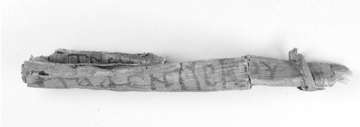
Fig. 2.1: Coptic papyrus letter, preserved in genuine folding; provenance unknown. 7th/8th century. The external address: “Give it to Tiskou!” is visible outside, while the slightly unrolled part above gives a glance at the first line of the inner side, containing the greeting formula “+ We greet thee ...”. (Photograph by courtesy of the Museum Bibel+Orient of the University of Fribourg, Switzerland, inv. AeT2006.11).