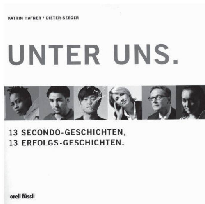
Illustration 5a: Cool Cosmopolitans vs. unassimilatable Others: Cover of the book Among Us (2007) portraying 13 successful “secondos” ...

Looking at subject-making of second generation Indians, an ethnic signature is inscribed into the state, capitalism, and popular culture, which seems to be at the core of current globalization processes. As Stuart Hall argues, neo-liberal globalization, instead of erasing cultural difference, stages and commodifies cultural difference as a way of linking global capital to local places. The commodification of the “exotic Other” enables one to make sense of globalization, while identifying with a cosmopolitan ideal. 41 Hence, being produced in the global logic of consumption and production, the subjectivities of second generation Indians are also embedded in technologies which produce and reproduce patterns of social inequality and segregation hidden at first sight. 42 In the case of Switzerland, the public representation and self-fashioning of the second generation is divided by class. Second generation youths with middle class backgrounds in advertisement, political debate, and cultural production are often looked at as “cool cosmopolitans”, representing a liberal globalizing Switzerland. In contrast, working class Ex-Yugoslavians and Muslims, especially in political debate and the news, are represented as the “unassimilatable, criminal Oriental”. 43