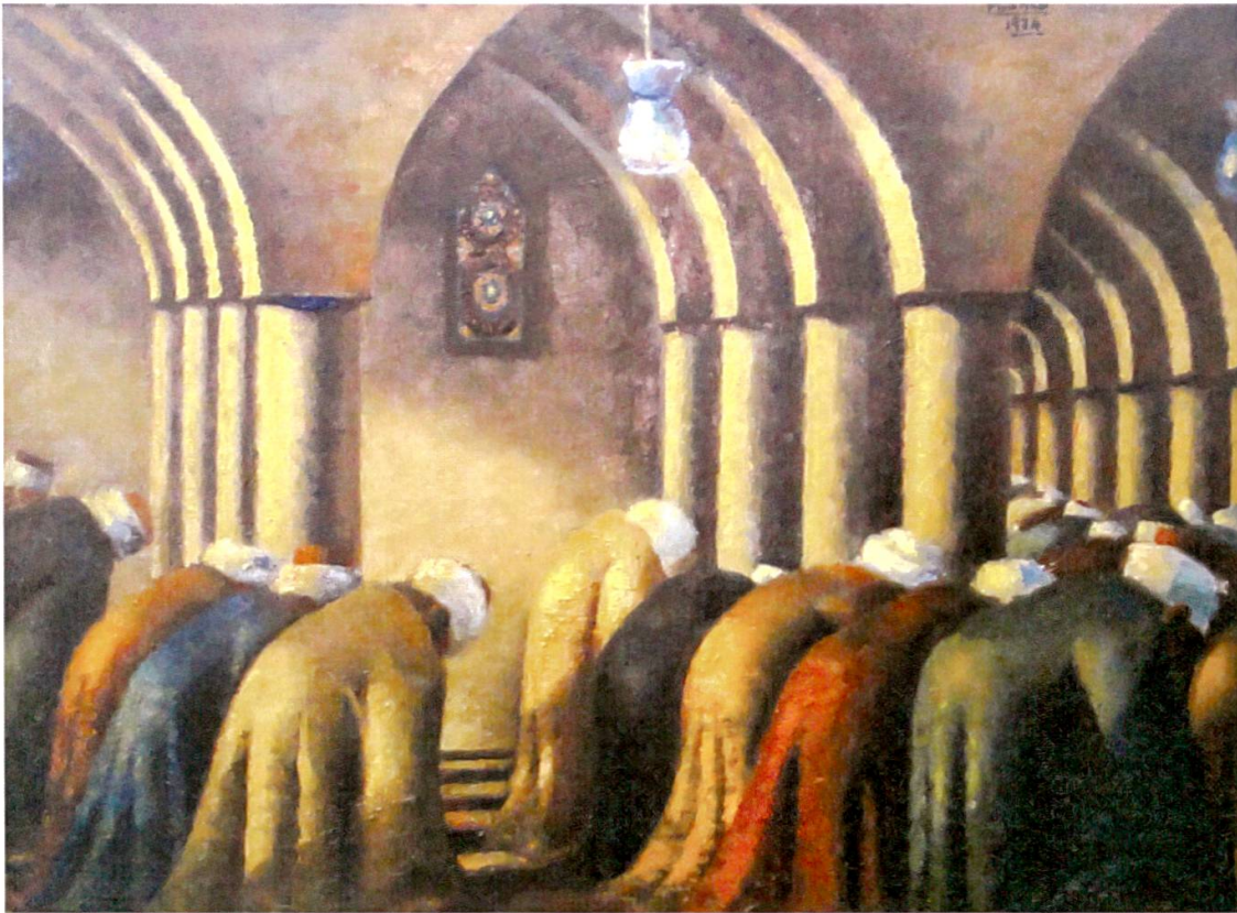
Figure 2: Mahmoud Saïd, Prayer , oil on plywood, 58 × 79 cm, 1934.

expressed his profound admiration for the Italian Primitives as well as the influence of the Venetian Renaissance on his paintings (Figure 2). 28