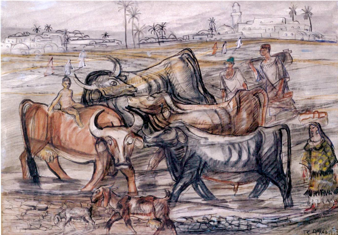
Figure 5: Ragheb Ayad, The Field , ink and watercolour on paper, 1954. Photograph by Mai Hussein Badr. Courtesy: Museum of Egyptian Modern Art, Cairo.

his depictions of the peasants' daily lives (Figure 5). 37 All of them however remained connected to Italy throughout their career and would regularly return to their host country.