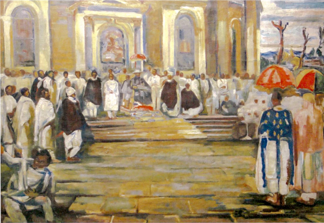
Figure 6: Mohamed Naghi, Palm Sunday in Abyssinia , oil on canvas, 79 × 151 cm, 1932.

government regarding the presence of its military troops in the country. This was the beginning of the artists' so-called "Abyssinian period", a prolific production characterized by vivid light and warm colours inspired by Ethiopian landscapes. It appears that during that time Naghi was more focused on his artistic production than on conducting diplomatic affairs. He painted works representing scenes of Ethiopian daily and court life, including several portraits of the Negus Haile Selassie (Figure 6). 41