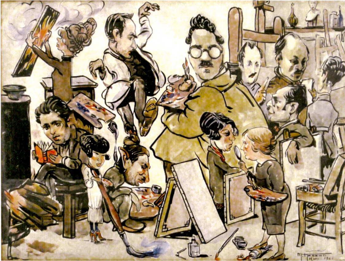
Figure 4: Mohamed Hassan, The Studio , ink and watercolour on paper, 44 × 58 cm, 1926.

The 15th Venice Biennale was marked by the participation of the Italian Futurists. The U.S.S.R. had devoted its pavilion to the Mostra del Futurismo Italiano curated by the founder of the movement, Filippo Tommaso Marinetti (1876–1944). Among others, the exhibition displayed works by leading figures of Futurism, such as Giacomo Balla, Umberto Boccioni, Lionello Balestrieri and Enrico Pamprolini. 35 In his report, Ragheb Ayad expressed his admiration for the Futurists, whose influence is perceptible in the dynamic lines and vibrant touch characterizing his early works.