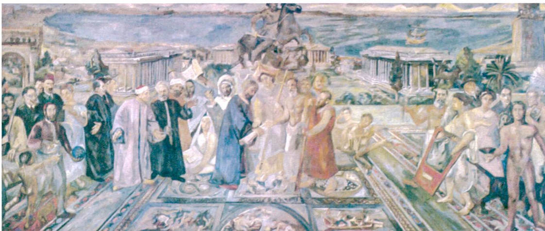
Figure 7: Mohamed Naghi, The School of Alexandria , 700 × 300 cm, oil on canvas, 1952.

Naghi paid tribute to Marinetti in one of his major works entitled The School of Alexandria , which he had begun to paint one year after the Venice Biennale in 1939 (Figure 7). This large allegoric painting was one of the most ambitious works of his career, as he had worked on it for more than ten years, taking it with him on his diplomatic travels, including his journey to Italy where he was the attaché to the Royal Legation in Rome. He finally completed it in 1952 towards the end of his life in his studio located close to the Pyramids of Giza.