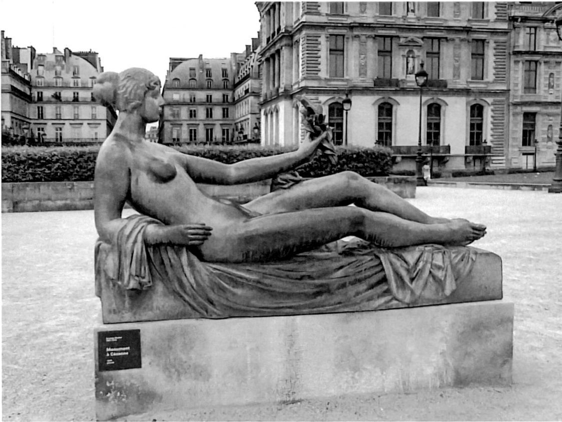
Illustration 9: Aristide Maillol, Monument à Cézanne , 1912–1925 © Elka M. Correa Calleja.