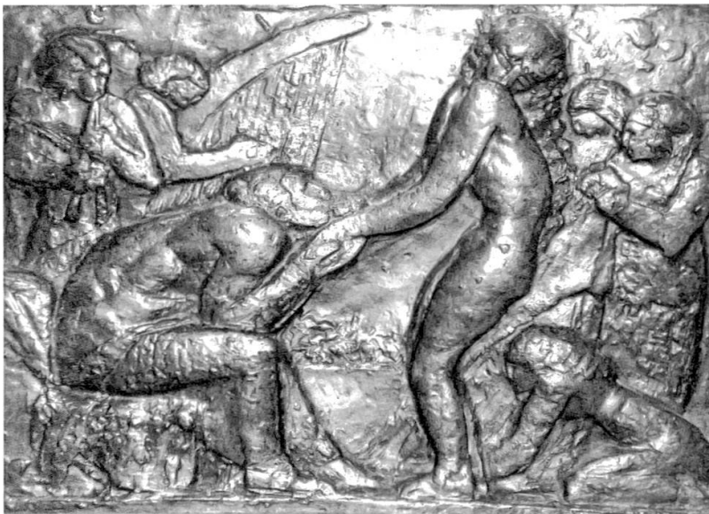
Illustration 8: Mahmud Mukhtar, Solomon’s Visit to the Queen of Sheeba, 1922

Even if in Mukhtar’s repertory there is no evidence of sculpture attached to architecture, he is likely to have been familiar with Bourdelle’s ideas and with his work at the Théâtre des Champs-Élysées , as we can see in a bas-relief made in 1922 called Solomon’s Visit to the Queen of Sheeba (Illustration 8).