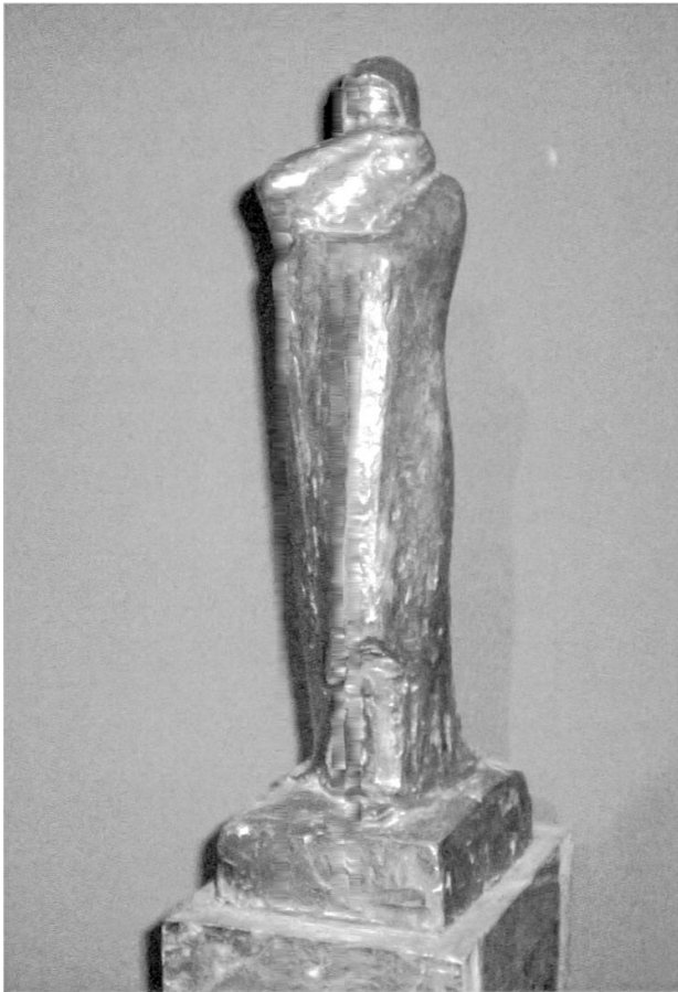
Illustration 3: Mahmud Mukhtar, When Meeting the Men, 1929

and managed to be first in the drawing test, 6 he failed the architecture test. 7 Consequently, he became a temporary student. This conditional admission could be changed a “definitive” one if he succeeded in winning three medals or honorific mentions in contests of which he already had won one. Nevertheless, historical events would impinge on Mukhtar’s future. On June 28 th , 1914, Gavrilo Princip, a Serb nationalist, killed the Archduke of Austria and heir to the Hapsburg throne, Franz Ferdinand. Mukhtar was in Paris when on August 3 rd , 1914 Germany declared war on France. Mobilizations to the front started and the School of Fine Arts was deserted. In the midst of great indecision, Mukhtar was sent back to Egypt 8 but shortly returned to France.