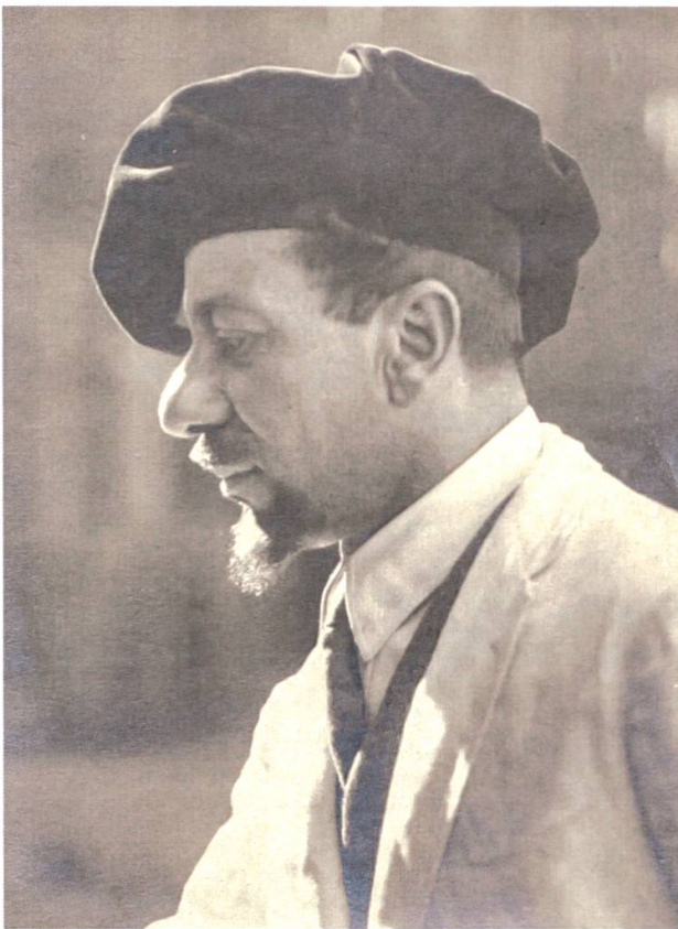
Illustration 1: Mahmud Mukhtar

Mahmud Mukhtar was to become the most celebrated Egyptian artist, whose impeccable legend answered the needs of the national discourse. 3 He was born in 1891 at Tanbarah, a village in the Nile Delta. At a very early age he moved to Cairo and, just 17 years old, he was admitted to the Fine Arts School. In 1912, after he graduated, Yusuf Kamal sent him to Paris. Here, he was a witness to the First World War, a conflict that would interrupt his studies. Nevertheless, he managed to continue working and in Egypt he became a celebrity, especially in 1928, after the inauguration of his public statue Egypt's Awakening . His success acquired an international dimension after the exhibition at the Bernheim-Jeune Gallery in Paris in 1929. He died prematurely at the age of 43 in 1934 (Illustration 1).