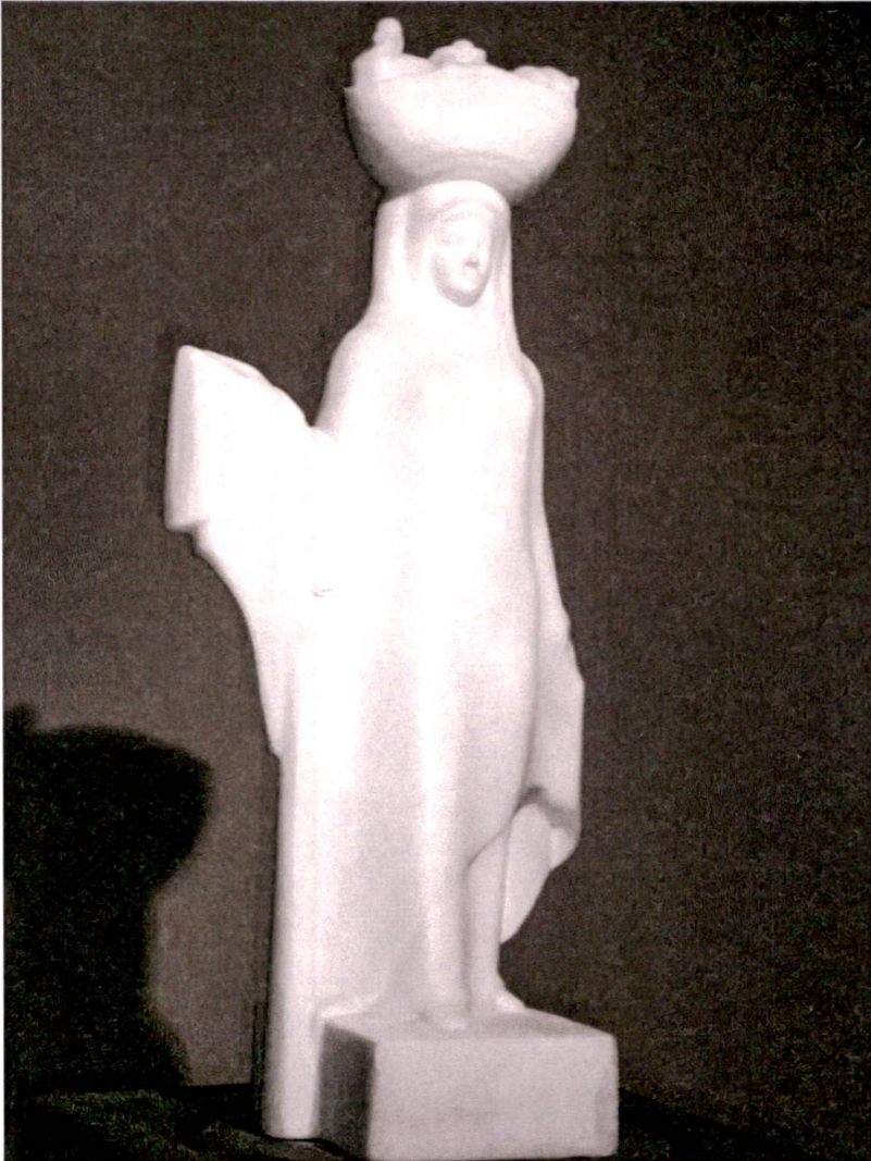
Illustration 5: Mahmud Mukhtar, Return From the Market , 1928 © Elka M. Correa Calleja.

intermingling of the different peoples and cultures, 30 where identity is no longer singular but becomes multiple. In Mukhtar's case, not only the Pharaonic past is recalled, but also Egypt is linked with a broader Mediterranean identity that shares symbols, history and a way of life.