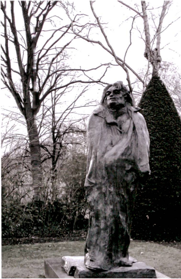
Illustration 4: Auguste Rodin, Balzac, 1891–1897