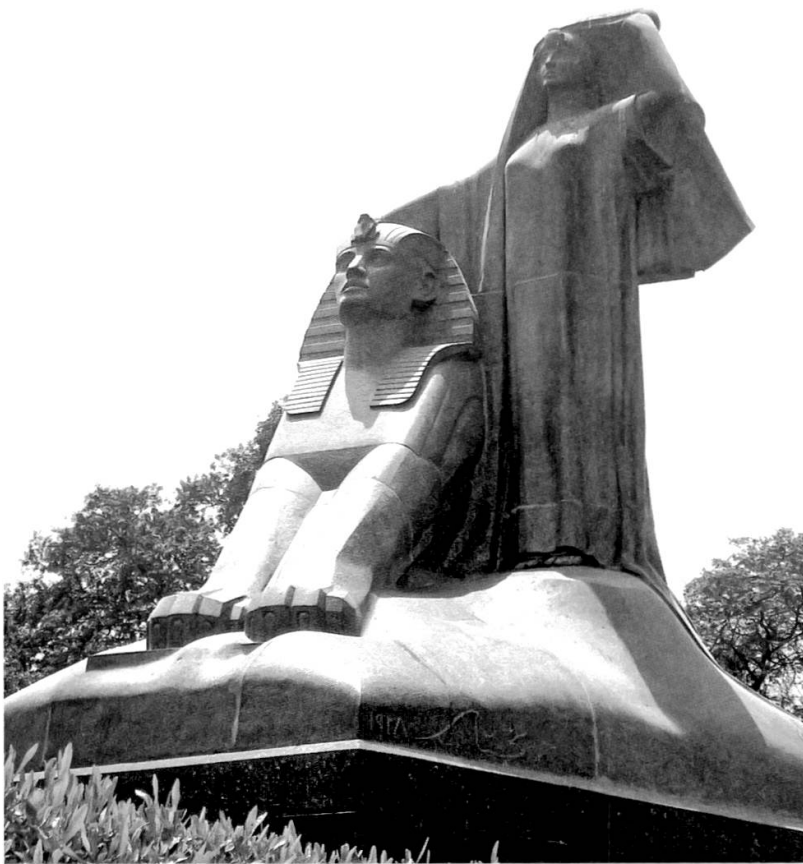
Illustration 6: Mahmud Mukhtar, Egypt's Awakening , 1928 © Elka M. Correa Calleja.

dead of the First World War. The name of the statue was La France and would ornate a one hundred meter tower called La Grave that celebrated the entry of the United States into the conflict. After some difficulties, the project was assigned to Bourdelle. In complete harmony with the ideal of the return to the classical order, the sculptor conceived a statue for the celebration of peace. Bourdelle was the “man of the moment”, because his artworks would help rebuild French culture whose main values had been questioned during the war. His statues incarnated positive values such as liberty or victory and placed the state as the Guardian of Peace (Illustration 6). 31