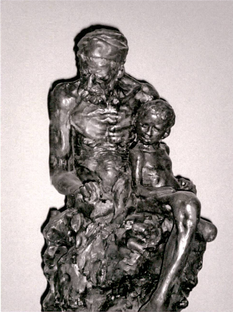
Illustration 2: Mahmud Mukhtar, The Beggar and His Son, 1910