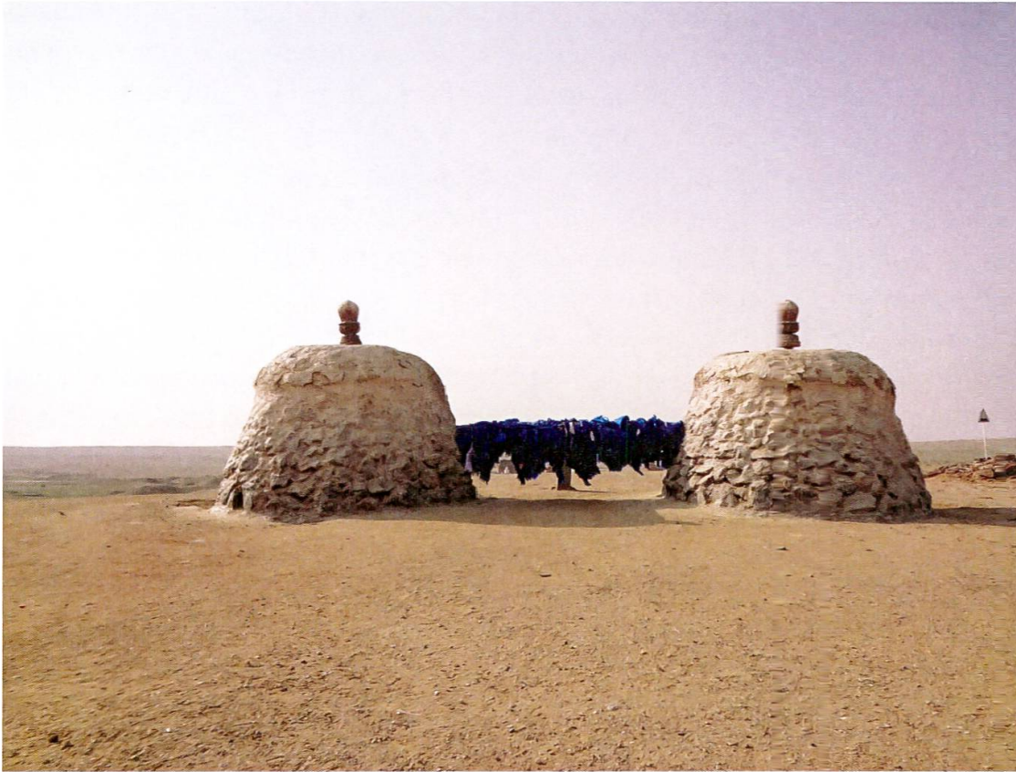
Figure 3: The “breast oboo”.

Buddhism. 75 Not far from the temple complex, some two to three kilometres to the north-east, a site dedicated to the realm of Shambhala was built. The site in the form of a maṇḍala is surrounded by 108 76 stūpas (Figure 4). Danzan Ravjaa had a special affinity to the mythical realm of Shambhala that is closely connected to the Kālacakra tantra . 77 According to this tantra and other Tibetan sources 78 the mythical country of Shambhala lies somewhere north of the Himalayas and north of the mythical river Sitā. The country has the form of an eight-petalled lotus, which is surrounded by two ranges of snow-mountains. According to Tibetan and Mongolian Buddhist tradition, in Shambhala no evil is known, its people are naturally virtuous and good. Most of them obtain Buddhahood during their lifespan in Shambhala. Once somebody is born in this realm, he will never be reborn into a lower form of existence. This description shows close affinities to Buddhist concepts like the Buddha fields of