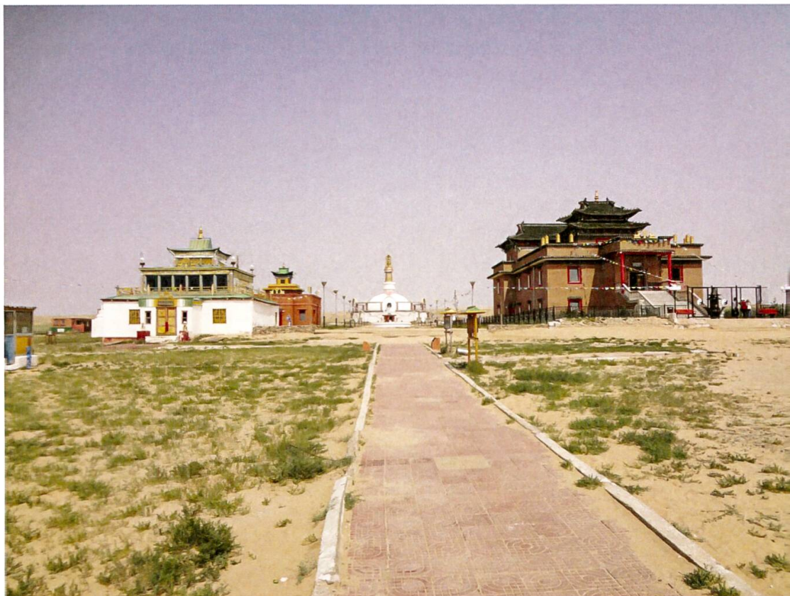
Figure 1: The yellow and red temple.