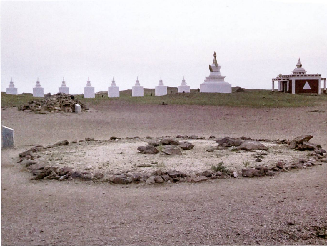
Figure 4: The Shambhala Energy Centre.

Sukhāvātī or Potala , but in one important aspect Shambhala differs from them. It includes an apocalyptic vision of a future battle between the last kalki of Shambhala, Raudracakrin, and the ruler of the infidels (Tib. kla klo , Mo. lalo ). 79 One of the earliest Tibetan texts to deal with the kingdom of Shambhala, the sDom pa gsum gyi rab tu dbye ba of the Sa skya paṇḍita Kun dga' rgyal mtshan (1182–1251), describes the battle and its outcome thus: