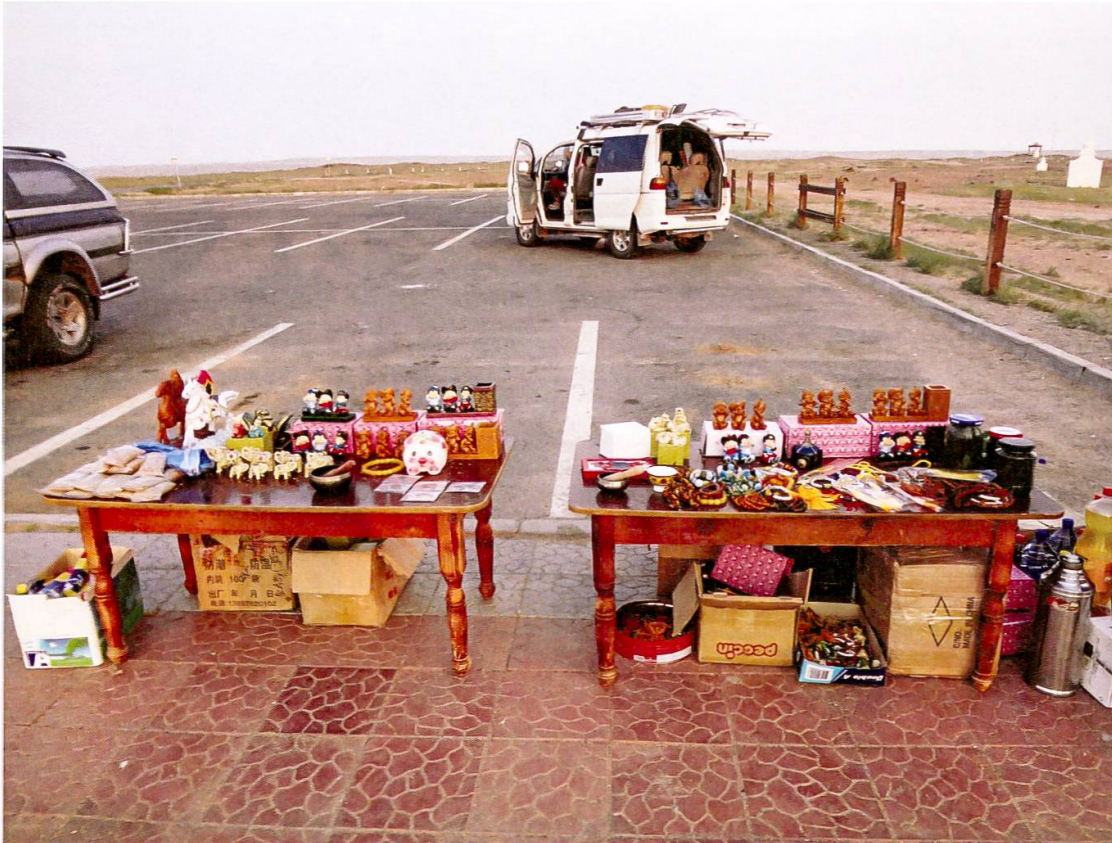
Figure 5: Souvenirs.

plastic wind horses (Mo. khii mori ), a couple of white stone elephants and other regalia considered to be particularly auspicious (Figure 5). At the ger camps, however, religious souvenirs are sold at a larger scale.