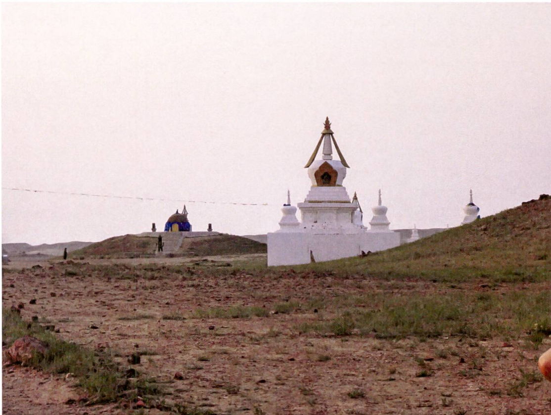
Figure 6: Tarkhi ovoo.

depression called “The stomach of the hungry ghost”. At that spot, the pilgrims should burn previously prepared papers on which they have listed their non-auspicious deeds in this lifetime. A bit further in the square, they come to three small rock cairns building a diagonal line. The rocks point to Bayanzurkh Uul, the sacred mountain of the Third Noyon Khutagt. Here the pilgrims offer vodka. They will finally reach the most sacred part of the Shambhala Energy Centre, a small round hill on whose top is the Tarkhi Ovoo (Figure 6). The hill itself resembles a kapāla , a skull-cup used in tantric ritual, upon which an oboo is placed. The pilgrims circumambulate the oboo , all the while reciting wish-prayers to be reborn in Shambhala after death.