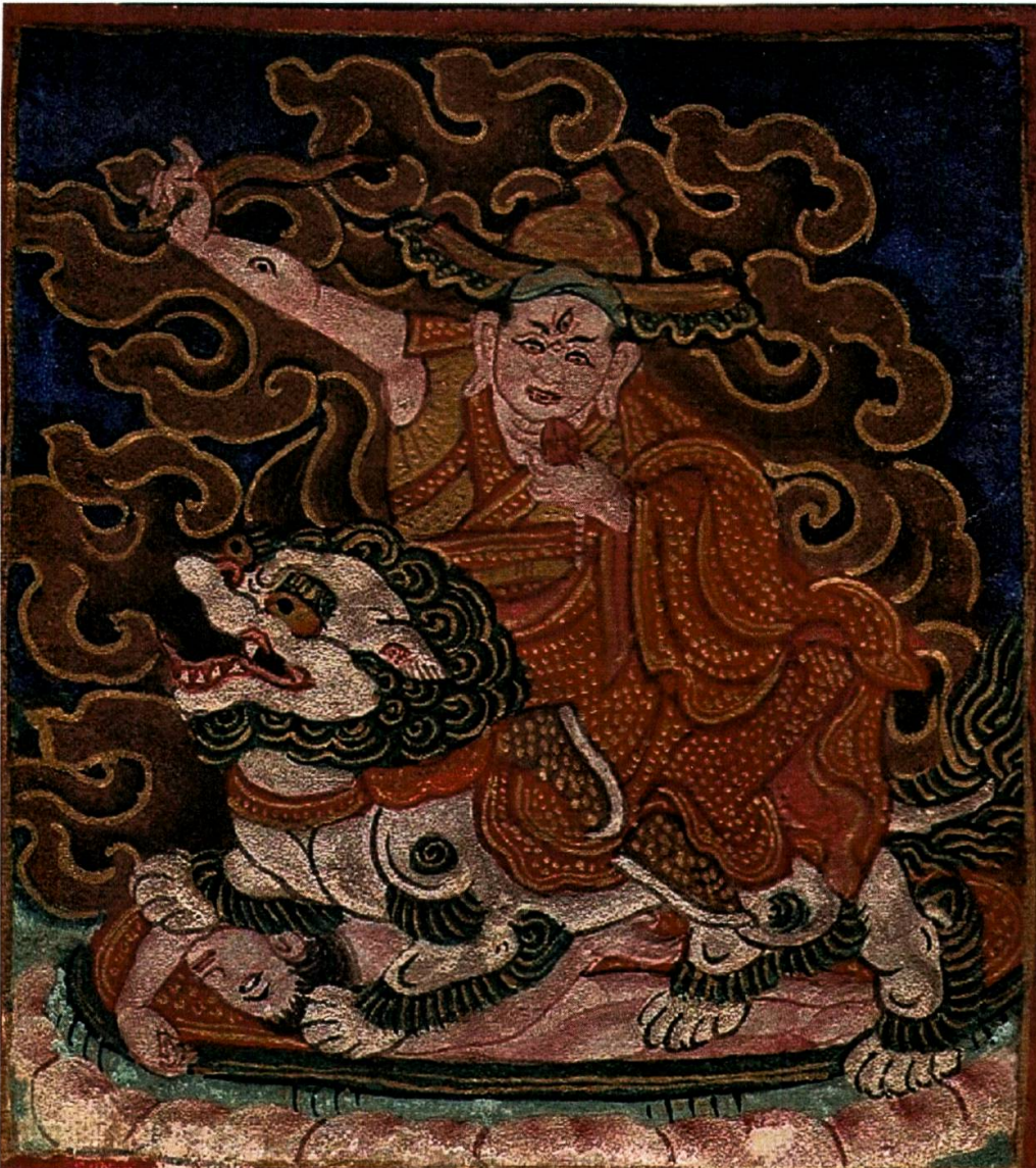
Early twentieth century image of peaceful Dorjé Shukden from Mongolia, on display in the Zanabazar Museum of Fine Arts ( G. Zanabazarın Neremjit Dürslekh Uurlagiin Muzei ), Ulaanbaatar, Mongolia. Also available as item 50,725 in the Himalaya Art Resources database ( https://www.himalayanart.org ).

and transmission. Of far greater importance than the questionable status of the Fifth Dalai Lama (who, I should note, Zava Damdin quotes extensively as a major enlightened authority in all of his major historical works), is the place of Shukden in scholastic transmission and locating Khalkha monastic life within the tangled sovereignties of the Qing-Géluk formation.