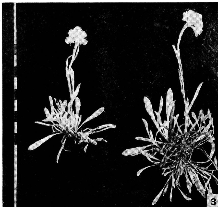
Fig. 3. Antennaria carpatica \times A. dioica : left—plant from the natural habitat; right—the experimental hybrid. The intervals of the scale comport 1 cm.

Comparative studies of the experimental hybrids revealed their notable similarity to the Alpine plants (Fig. 3). They had a similar type of rhizomes,