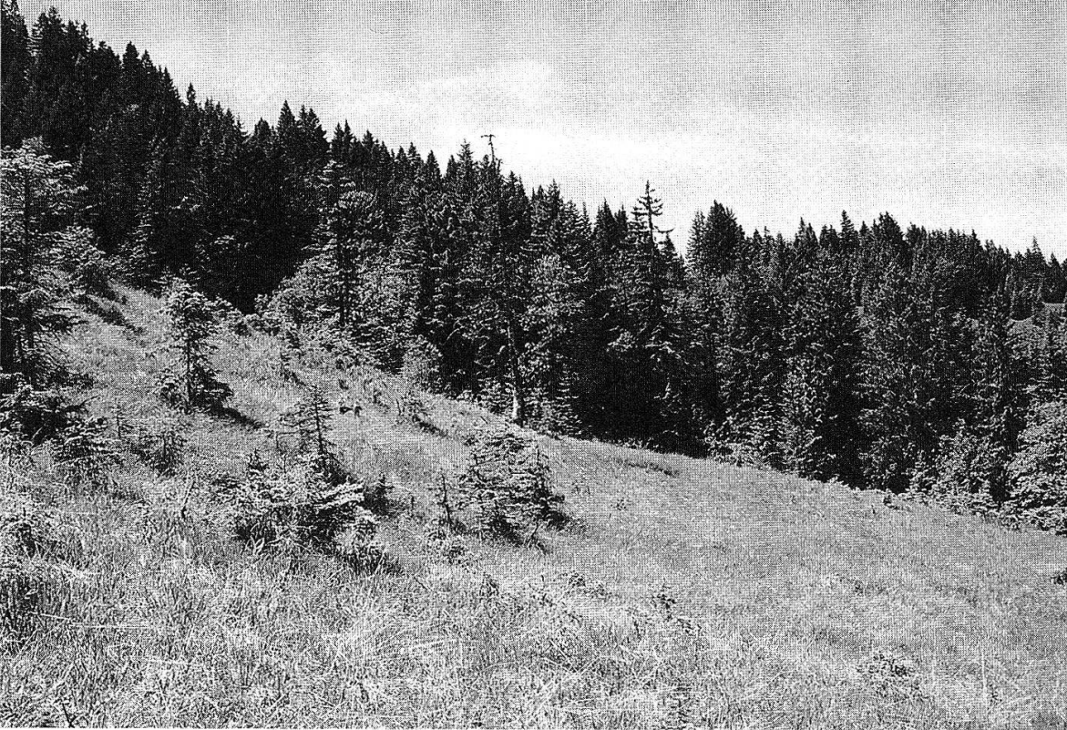
Fig. 1. Typical montane fens in Switzerland: (a) 'Chellen', an annually mown, species-rich fen; and (b) 'Hirzegg', a fen where mowing was abandoned 35 years ago, with accumulation of litter, reduced species richness and spontaneous reafforestation.