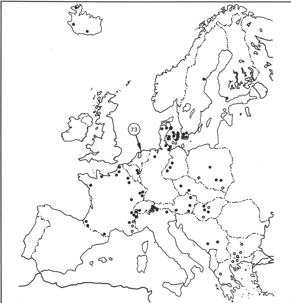
Fig. 1. Localities of the cytologically investigated plants of Galium verum L. The diploid is represented by an open dot, the tetraploid by a black dot. The no. 73 represents the number of localities investigated for the Netherlands.

Within the diploids three groups could be recognized. One group of well-developed plants, 50–80 cm high, with erect stems. The lower parts glabrous, the upper parts becoming increasingly puberulent with short curved (not uncinata) hairs. Flowers and fruits glabrous. Flowering branches short, shorter than or exceptionally as long as their corresponding internodes, forming a narrowly cylindrical poorly flowering and interrupted panicle. The leaves are linear, up to 2.5 cm long and up to 2 mm wide. Compared to the other two groups the plants of this group have relatively long pedicels (up to 3 mm) and relatively large flowers (3–4 mm). – The plants characterized in this way were collected in the French Alps (Hautes Alpes, Alpes Maritimes and Savoie) and in