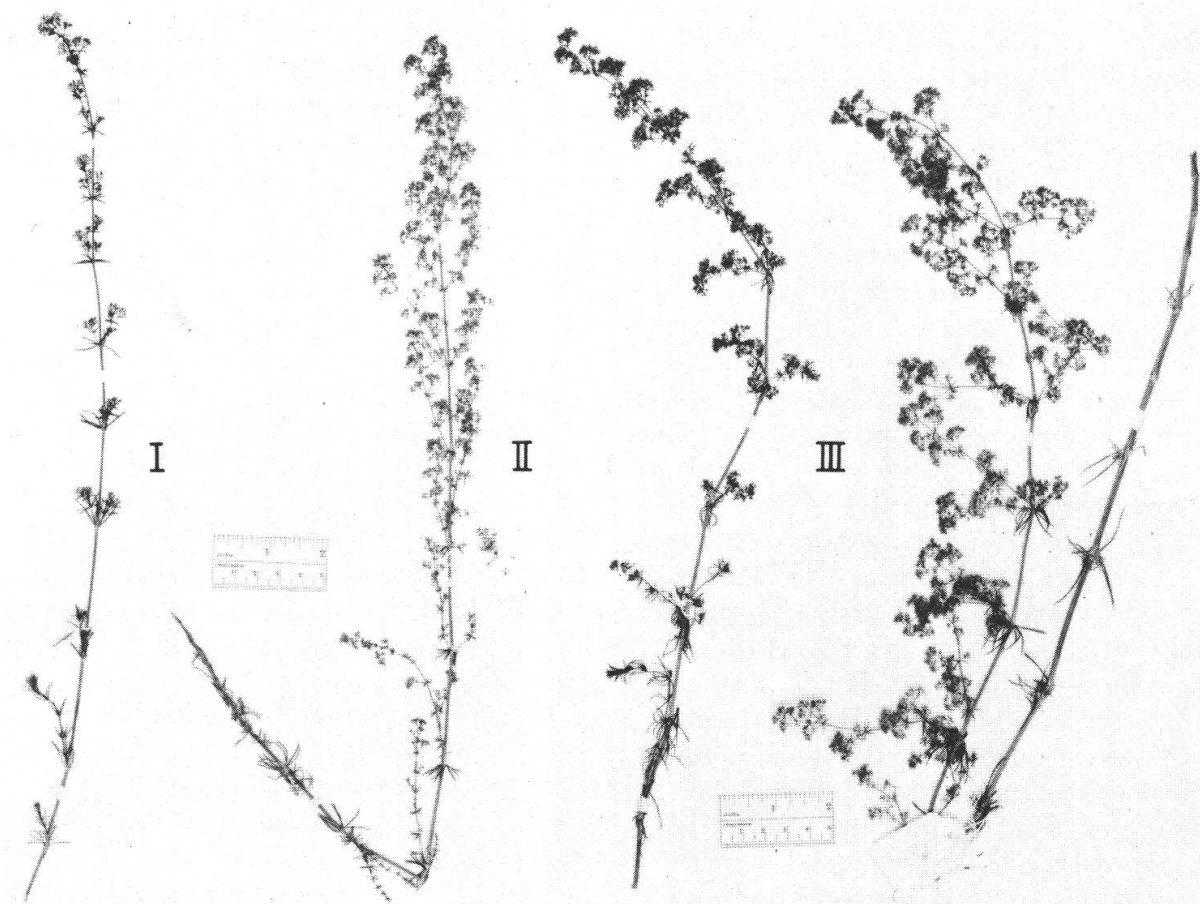
Fig. 2. Voucher specimens of Galium verum L. of the three groups found within the diploid cytotype: I – ssp. wirtgenii (F. Sch.) Ob., collected in Switzerland; II – ssp. verum from Bulgaria; and III – ssp. verum from Poland, showing the variability of the panicle in two years of cultivation.

In figure 2, plants from the three groups found within the diploid cytotype are illustrated: I – ssp. wirtgenii , collected in Switzerland (no. K 224), II – ssp. verum from Bulgaria (no. K 3392) and III – ssp. verum from Poland (no. K 1682) in two years of cultivation demonstrating the variability of the panicle.