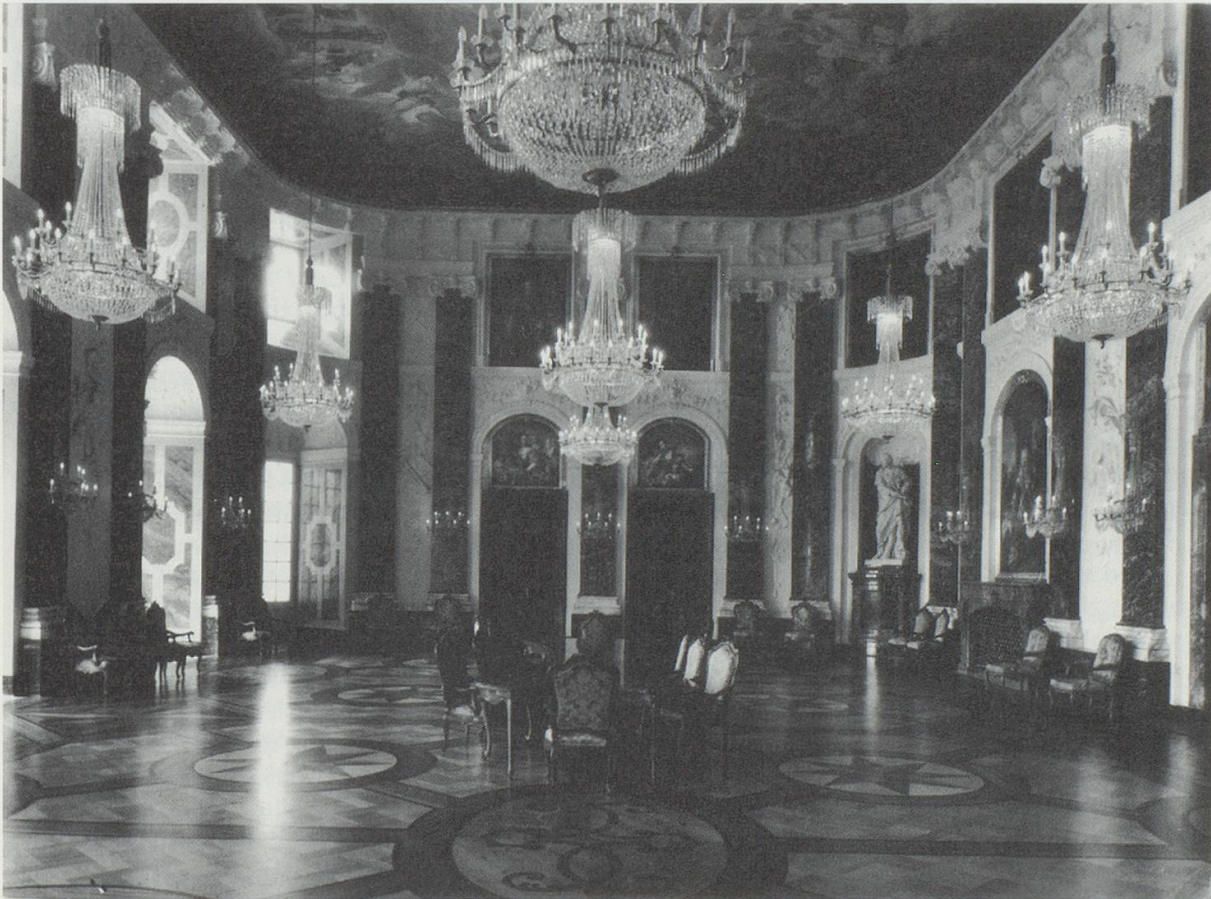
Figure 2: The Rittersaal of the palace, scene of the orchestral academies.

Aber was sahe ich da? – den Kurfürsten zwar in einem neuen Kleide, – allein es war Karl Theodor, wie im alten auch. – Die Kurfürstinnen hingegen, auf die ich eigentlich ausgegangen war, sassen so, dass ich sie nicht im Gesicht sehen konnte ... Doch ich gab mich zuletzt in Gedult, und horchte inzwischen auf das Orchester, mich durch die bezaubernden Töne einer Mamsell Schäfer 29 wieder mit meinem Schicksal aussöhnte. Der Kurfürst stund etlichemal auf, und gieng mit einem heiteren Lächeln an den Spieltischen herum. – Und nun erhoben sich dann auch die beide Kurfürstinnen von ihren Sesseln, kamen gegen das Orchester her, und hatten die Gnade, meine Neugierde durch ihr zugewandtes Antlitz sattsam zu befriedigen ... [Here the writer devotes an entire paragraph to a description of the electresses.]