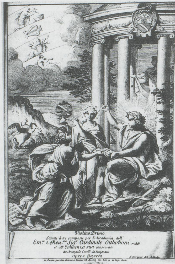
Fig. 2: Nicholas Dorigny, frontispiece of the Sonate op. 4 by Arcangelo Corelli.