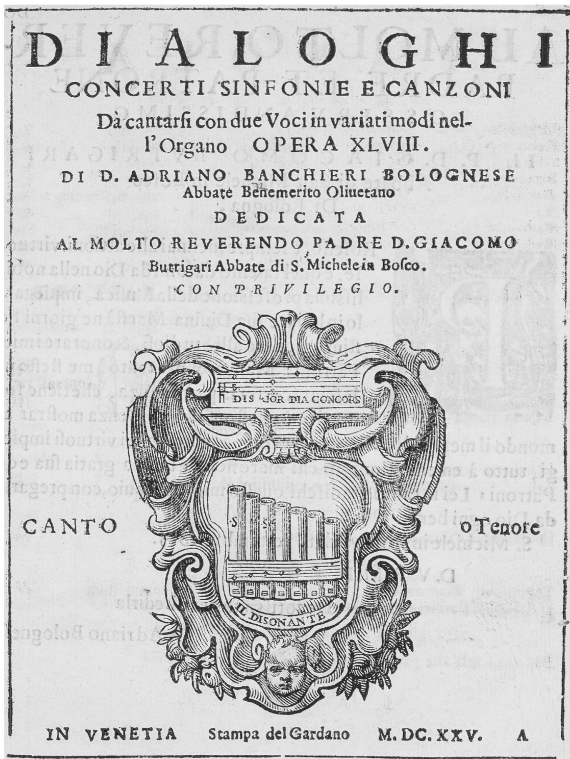
Fig. 4: Title page of Adriano Banchieri, Dialoghi concerti sinfonie e canzoni da cantarsi con due voci , Venice 1625. By permission of the British Library.

aesthetic, outlined above, resonates strongly with this understanding. Upending the Renaissance idea of instruments as imitators of the human voice, Marino sought to reconstitute the human voice through consideration of its mechanical