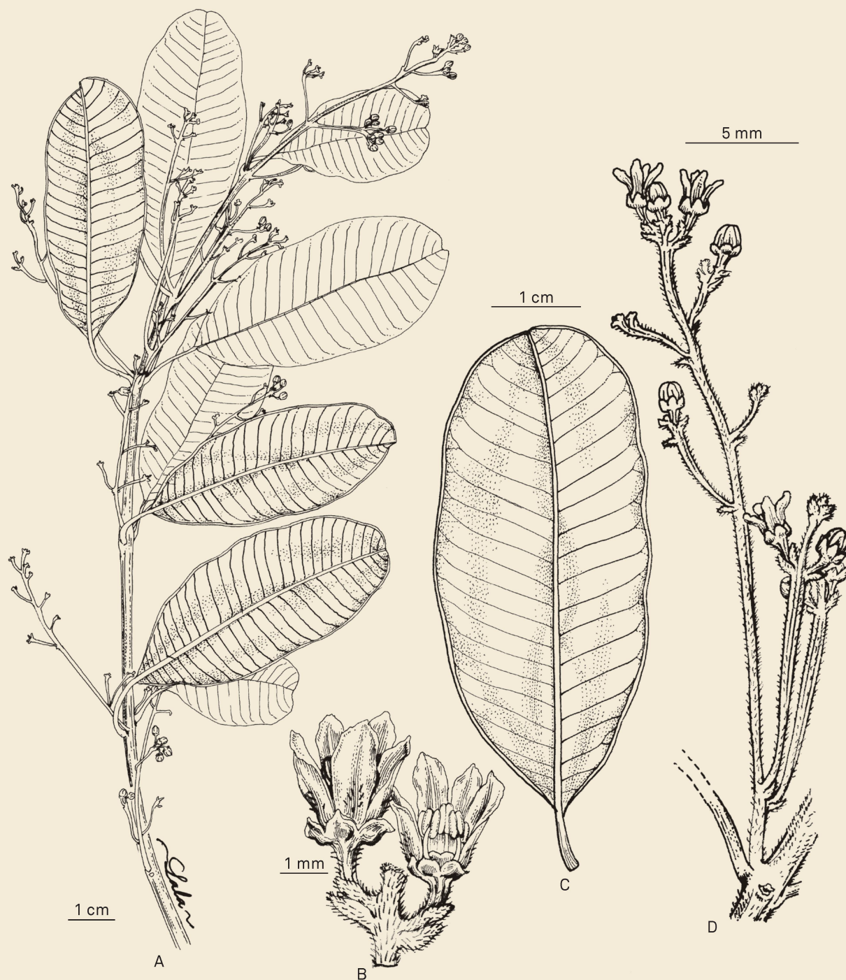
Fig. 4. Abrahamia capuronii Randrian. & Lowry. A. Flowering branch; B. Flowers (one with a petal removed); C. Detail of leaf; D. Inflorescence. [Service Forestier 767, P] Drawings: R.L. Andriamiarisoa