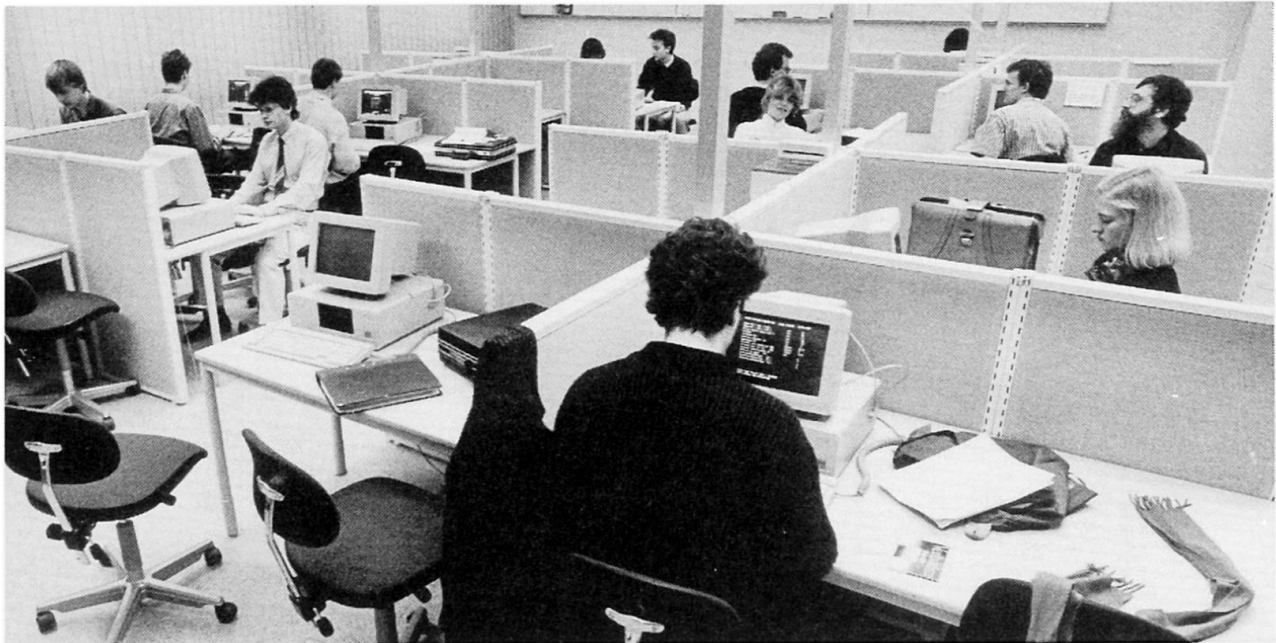
Fig. 1 View from one of the "computer laboratories"

At the School of Civil Engineering, Chalmers University of Technology, we have built a teaching environment based on 16-bit personal computers as a platform for computer training of our students. We have invested in two "computer laboratories", each containing 20 personal computers. From each computer there is printing, plotting and digitizing possibilities.