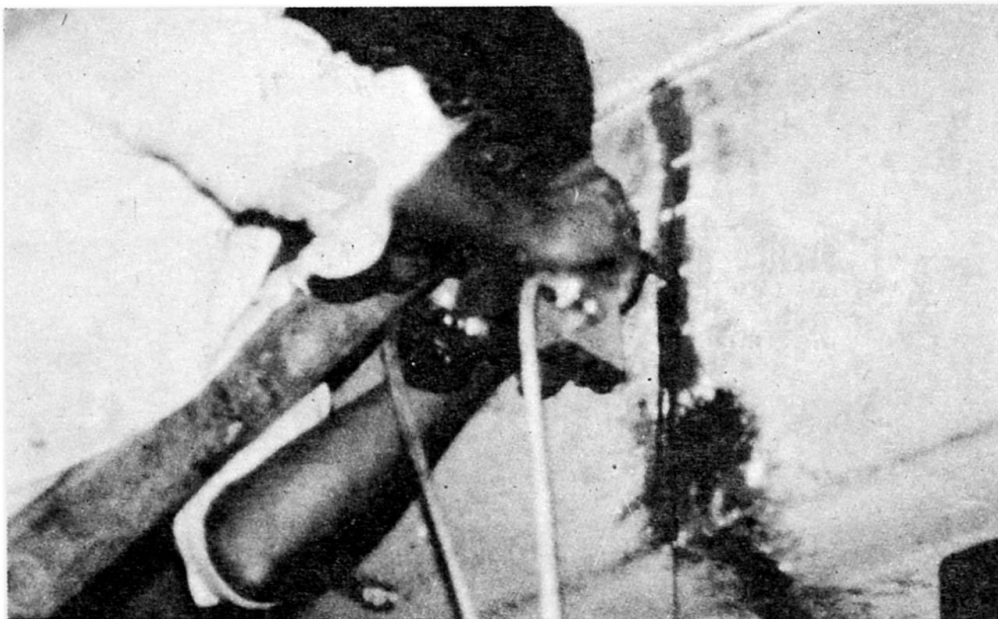
Fig.5 Building frame repaired by epoxy injection