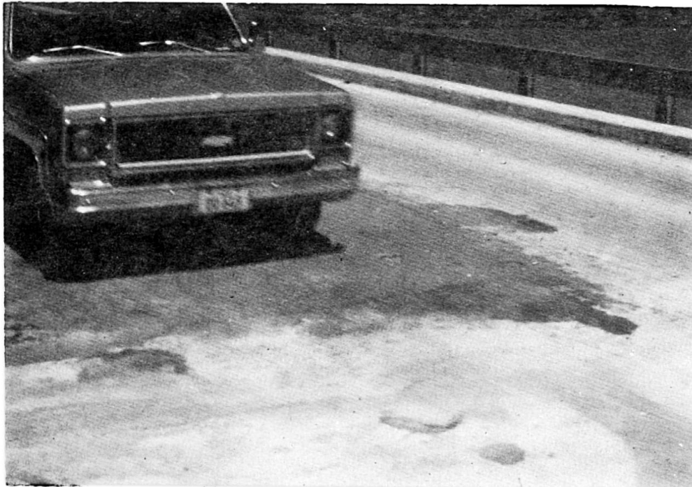
Fig.4 Bridge deck repaired by polymer concrete