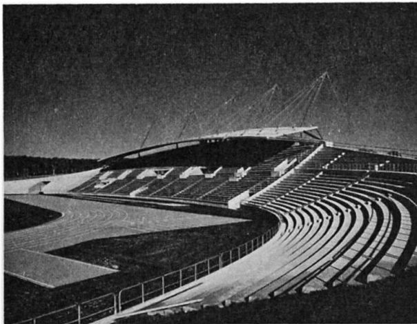
View from inside the stadium showing the grandstand with its cable suspended roof.

The roof consists of a cable-suspended structure with all of the supporting columns located at the rear of the stand to give unobstructed viewing from the seating.