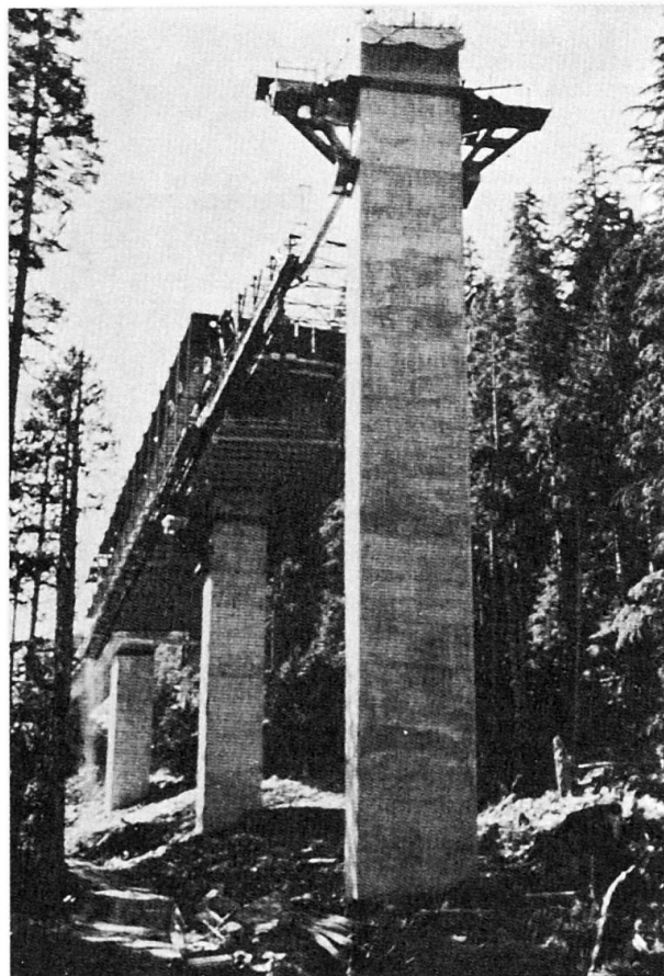
Fig. 4 Drawing of scaffold cross section for stage 1 shows truss jacks, method for supporting and removing forms for bottom and sides of box girders, and overhead dolly for removing inside forms.