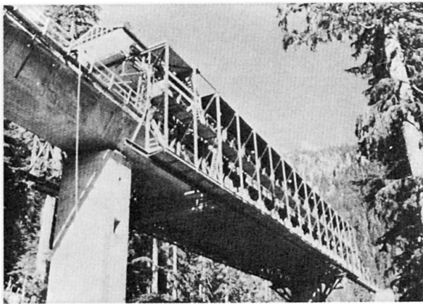
Fig. 1 Movable truss scaffold moves from pier to pier across the valley of Denny Creek, leaving behind the bottom and sides of post-tensioned box girder that will support the forms for casting the top and deck of the bridge superstructure.

The Washington Department of Transportation (DOT) was the first in the United States to use a movable scaffold to erect a post-tensioned concrete box-girder bridge. The scaffold – a 100 m long, 540-ton truss – moved across the valley from pier to pier to support the forms for the hollow box girder in the first stage of construction. With 20 spans totaling 1100 m, the post-tensioned bridge carries westbound 1-90 through scenic Snoqualmie Pass.