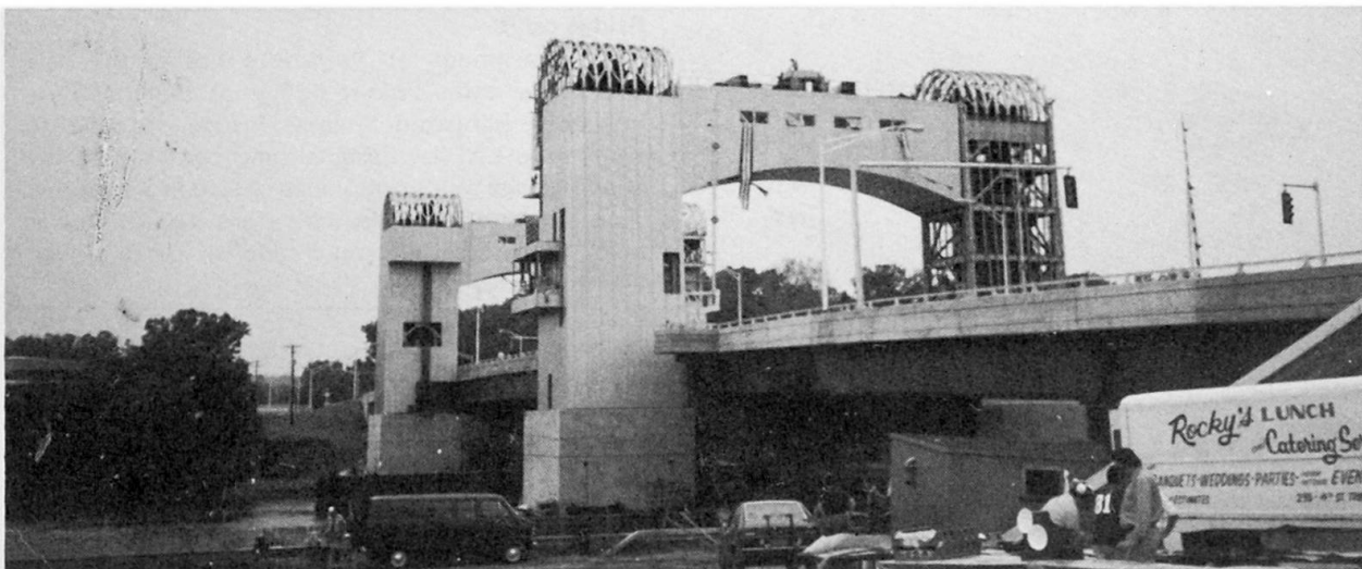
Towers being sheathed view