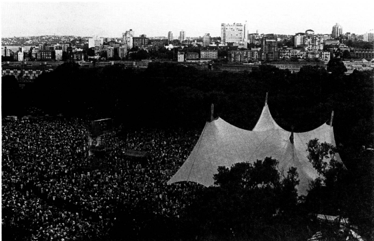
Fig. 1 The mobile stage during a performance

An internal cable support system was chosen against an external one because it enabled tighter control of deflections within the surface and flatter entrance curvatures at the high points. It was therefore possible to economise on the overall surface area required for coverage of