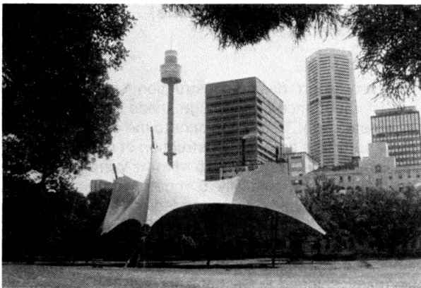
Fig. 2 The structure in its setting in the Domain

the opera-size stage by keeping the membrane surface close to the overhead lighting frame and by reducing overall mast heights as well as ground coverage. The maststays are integrated with the cable support system required for the membrane and thus the smallest number of perimeter anchorages and full lateral stability was achieved.