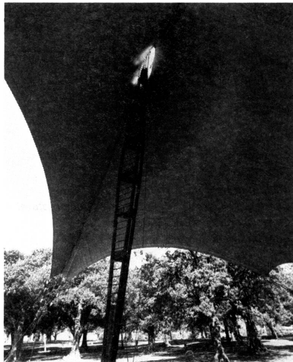
Fig. 4 Underside view showing mast, membrane corner and fabric pattern