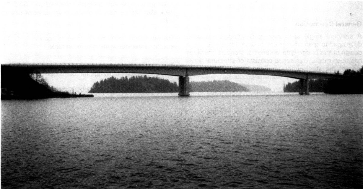
Fig. 2 View from the lake