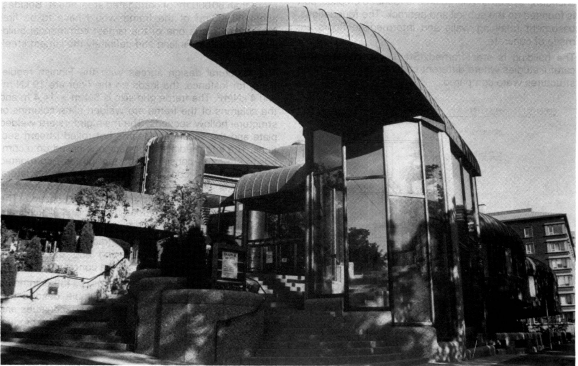
Fig. 3 Facade