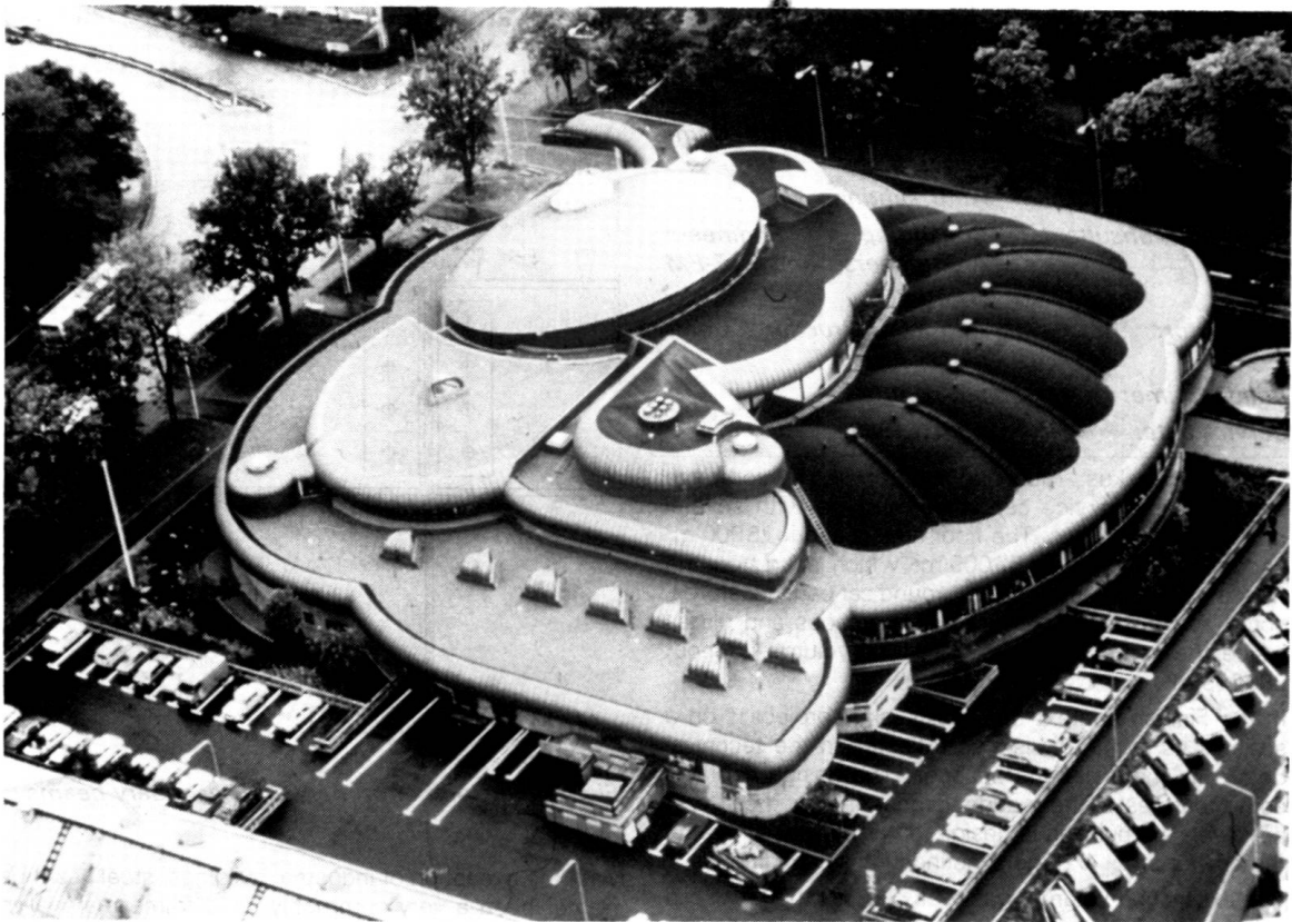
Fig. 2 Air Photograph