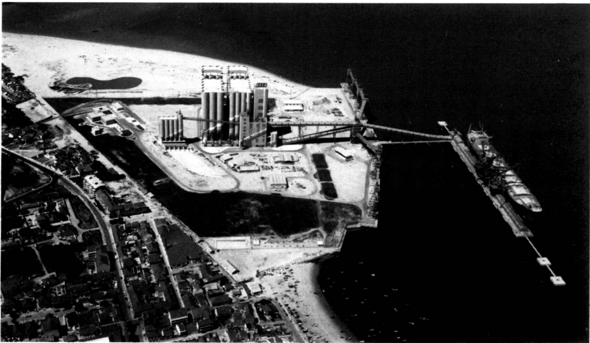
Fig. 1: Grain terminal of Trafaria – General view