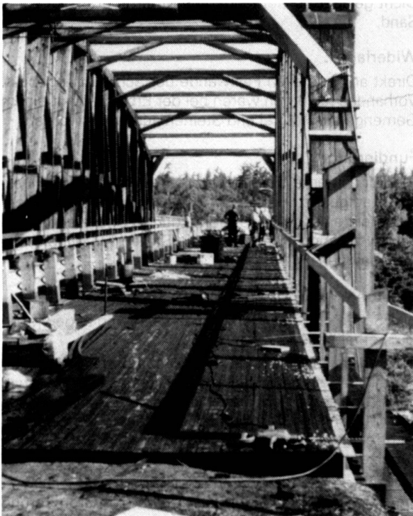
Fig. 3 Placing prestressed wood deck