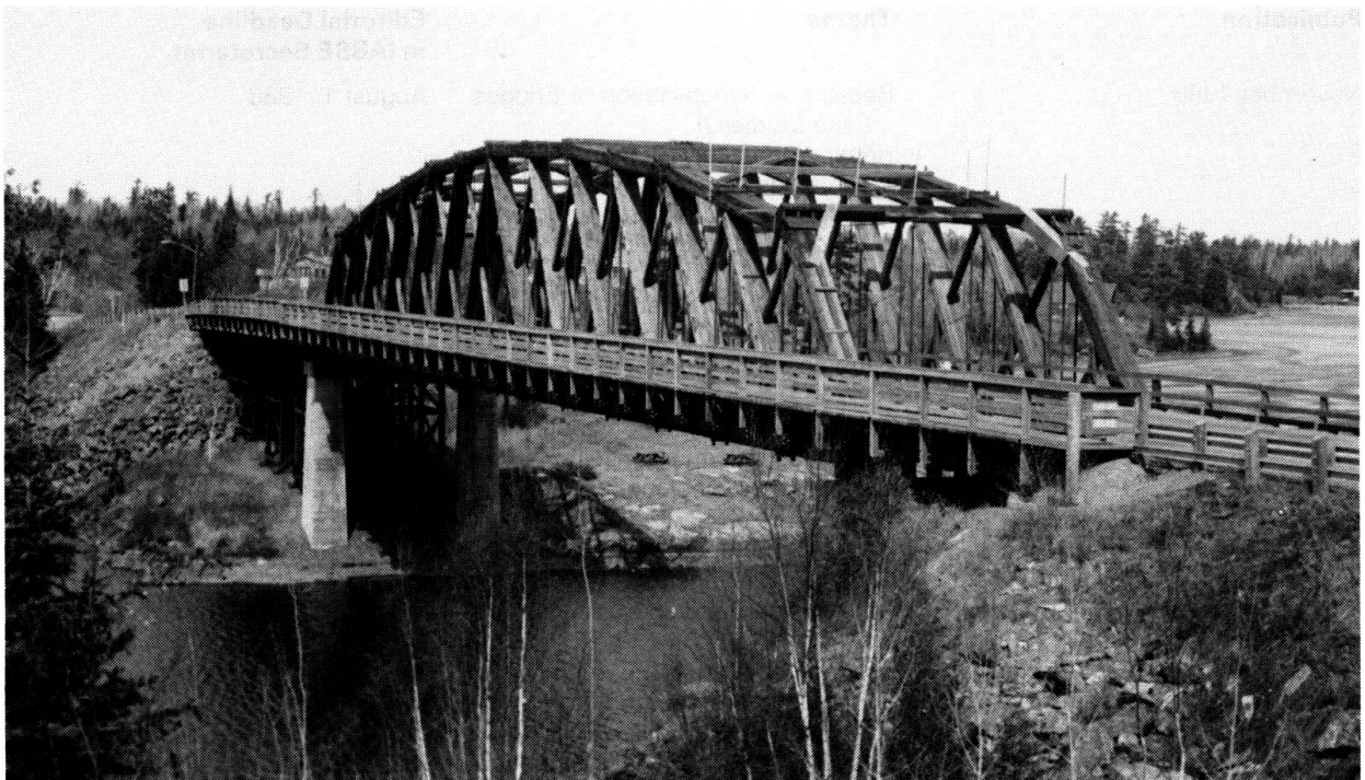
Fig. 1 General view of bridge

Full scale bridge testing using custom designed load vehicles, instrumentation and mobile laboratory for the computerized data acquisition system is a regular feature of the Ministry's evaluation procedures. Load testing of the deck system was carried out before deck replacement and after, Figure 4. Eight floor beams were instrumented by attaching strain gauges to the steel tie bars. The greatly improved longitudinal distribution characteristics of the prestressed deck was confirmed by a reduction of 35% in the truss bar strains for the same tests as carried out on the old deck. No further strengthening of the floor system is needed. The only other members that may need replacing are the main truss hanger bars, which will be tested shortly.