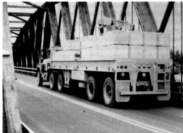
Fig. 4 Load testing the rehabilitated bridge

By the application of detailed analysis and testing and the use of an innovative deck rehabilitation scheme, the life of this heritage wood structure has been extended well beyond 50 years, and is performing satisfactorily under full highway loads.