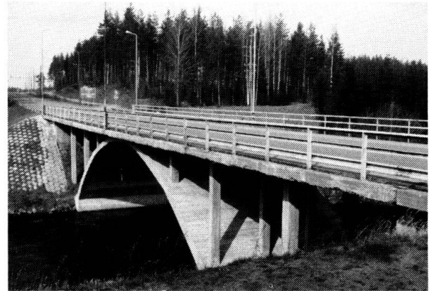
Fig. 1 The Käyräjoki bridge before repairing

The Käyräjoki bridge (Fig. 1) is located in a dell which causes that water is flowing on to the bridge more than otherwise. During wintertime the bridge is exposed to the salt-frost action. The bridge was built in 1963 when concrete was not air entrained. Consequently the concrete in the edge beams was scaling very badly twenty years after construction of the bridge.