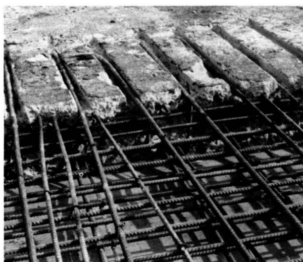
Fig. 3 The reinforcement of the cantilever

The reinforcement bars of the old structure were exposed about one meter and the new bars were anchored into the old concrete structure (Fig. 3). The quantity of the cement in concrete was 300 \text{ kg/m}^3 and the water-cement ratio was 0,50. The size of the aggregate was between 0 and 16 mm. Air entraining agent (aircontent 4,5–5,5%), plasticizer and retarder (retardation 24 h) were used. The concreting work started at noon and the work was finished the following morning at 6 o'clock. The air temperature was between +15 and +18°C.