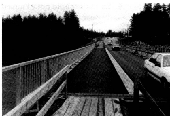
Fig. 4 The new sidewalk after the repairing work

The protecting and surfacing layers of the repaired bridge deck were accomplished as follows (Fig. 2):