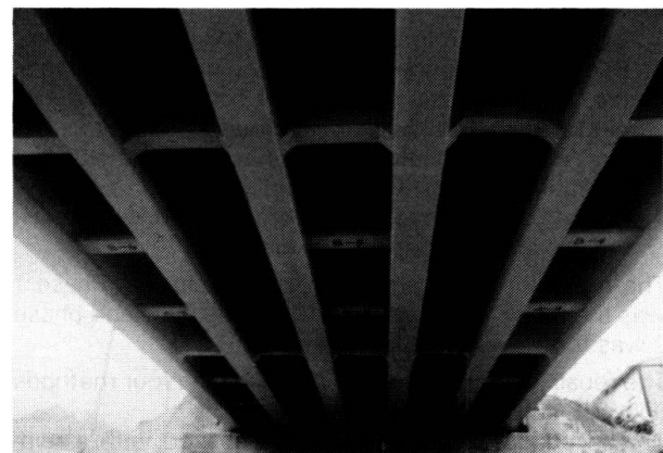
Fig. 2 After repair (Nadachi Bridge)

In applying anti-corrosive paints to these concrete structures having the normal surfaces not treated with paint, there were many unknown points, and it was thought to be important to conduct a research on the suitable kinds of anti-corrosive paints. Thus, four kinds of paints shown in Table 1 were applied to the rehabilitated bridge. Generally, for a structure into which salt has already penetrated, the salinity will vary depending on the location of the portion to be painted, so that the effect of painted material varies by the location. Thus the effect at different places cannot be compared on the same basis. Therefore, concrete slabs painted with four different kinds of paints and unpainted concrete slabs were exposed below this bridge (Fig. 1 and 2).