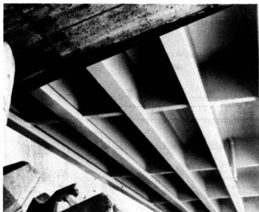
Fig. 4 After repair (Oyataroh Bridge)