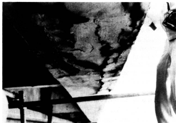
Fig. 3 Crack at lower flange (Oyataroh Bridge)