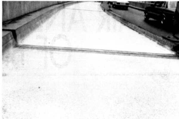
Fig. 4 The bridge complete with its new parapet before surfacing with bituminous mastic concrete