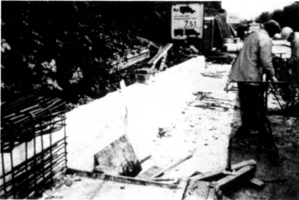
Fig. 3 Working on reinforcements for the construction of the new parapet