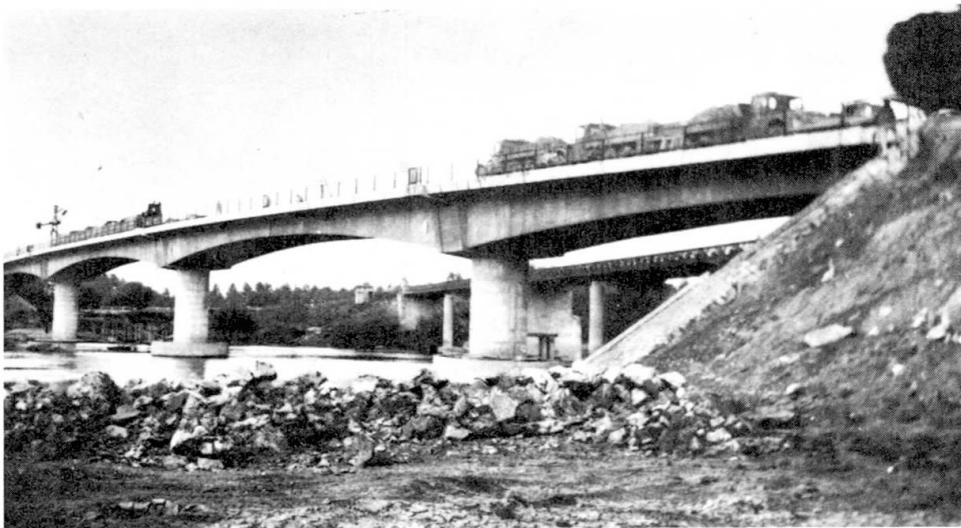
Fig.1 The 5-span bridge concreted without falsework across the river Váh at Kollárovo during testing

> 2,0 , i.e. the structure may have infavourable effects from biologic and psychologic point of view upon the driver. It might lead to a breakdown especially in the case of an adequate resonance during the passage of two vehicles moving against each other. It will be necessary to solve this problem for the design of modern subtle bridge structures.