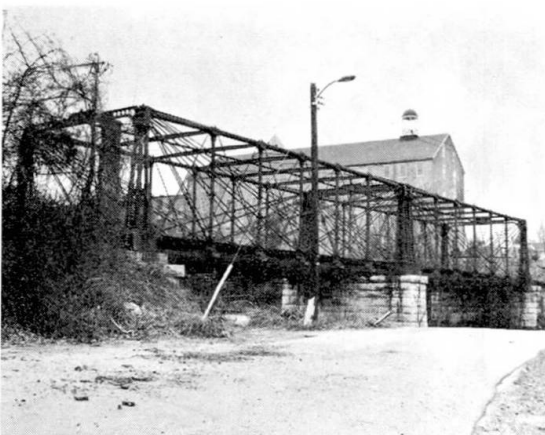
Fig.2. Bollman's Suspended & Trussed Bridge (1869) was relocated from a main line of the Baltimore & Ohio RR to service the mill at Savage, Maryland. It is the only known example of its type and facilitated the rapid expansion of early American railroads westward.