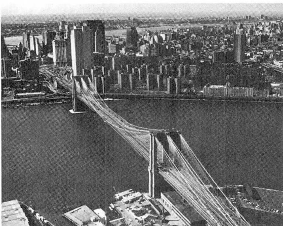
Fig.1. The Brooklyn Bridge, one of the most famous bridges in the world, celebrates its Centennial in 1983. Though no one would dream of replacing it, a cable corroded by pigeon dung snapped last year, killing a pedestrian; rehabilitation costs are estimated at $105 million.