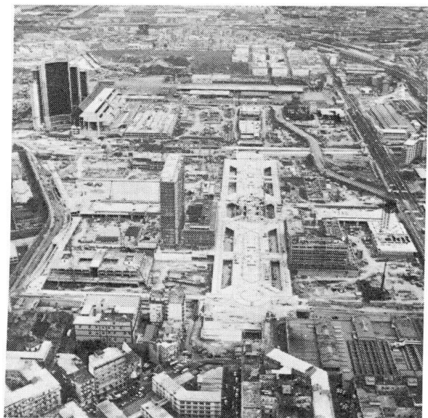
Business Centre of Naples