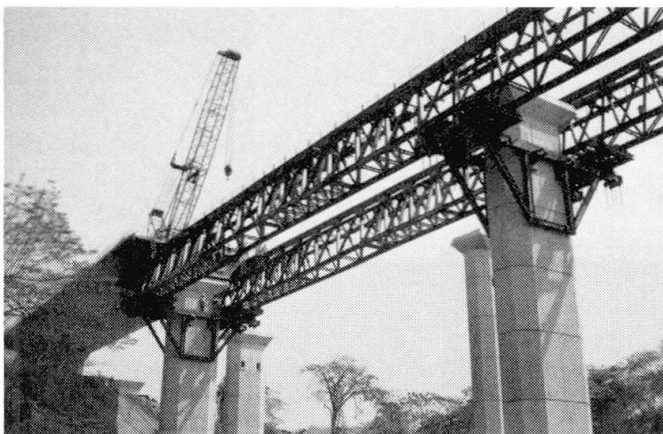
(Fig.1) Romulo Betancourt

The association of the 2 techniques : external prestressing and self launching truss has resulted in better productivity in the segment precasting and placing on the deck, particularly by savings in material and erection time on which the economic aspect of the project is based. For bridges with spans between 40 and 50 metres, erection speeds of 2 spans per week are currently achieved. On the Metropolitan Atlanta viaduc, up to four spans have been completed per week.