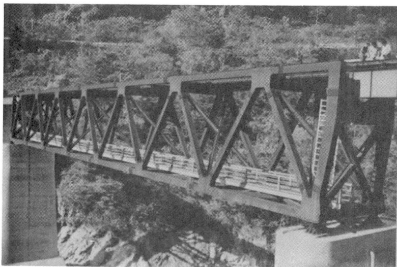
Photo 1. Third Okawa Bridge

A considerable number of railway bridges have been constructed of corrosion resistant steel, so-called "weathering steel", without painting in these ten years in Japan (say, 70 sets of span and 11,742 tons in total). Some of them were furnished with test specimens for future observation. This type of bridge has been applied to only an open type bridge, where the structural members are well exposed to rainfall and located in rural areas where air is not polluted. Such conditions are favorable to formation of the stable patina, an anticorrosive surface layer, which is essential to the protection of steel from corrosion. At present, all the bridges are